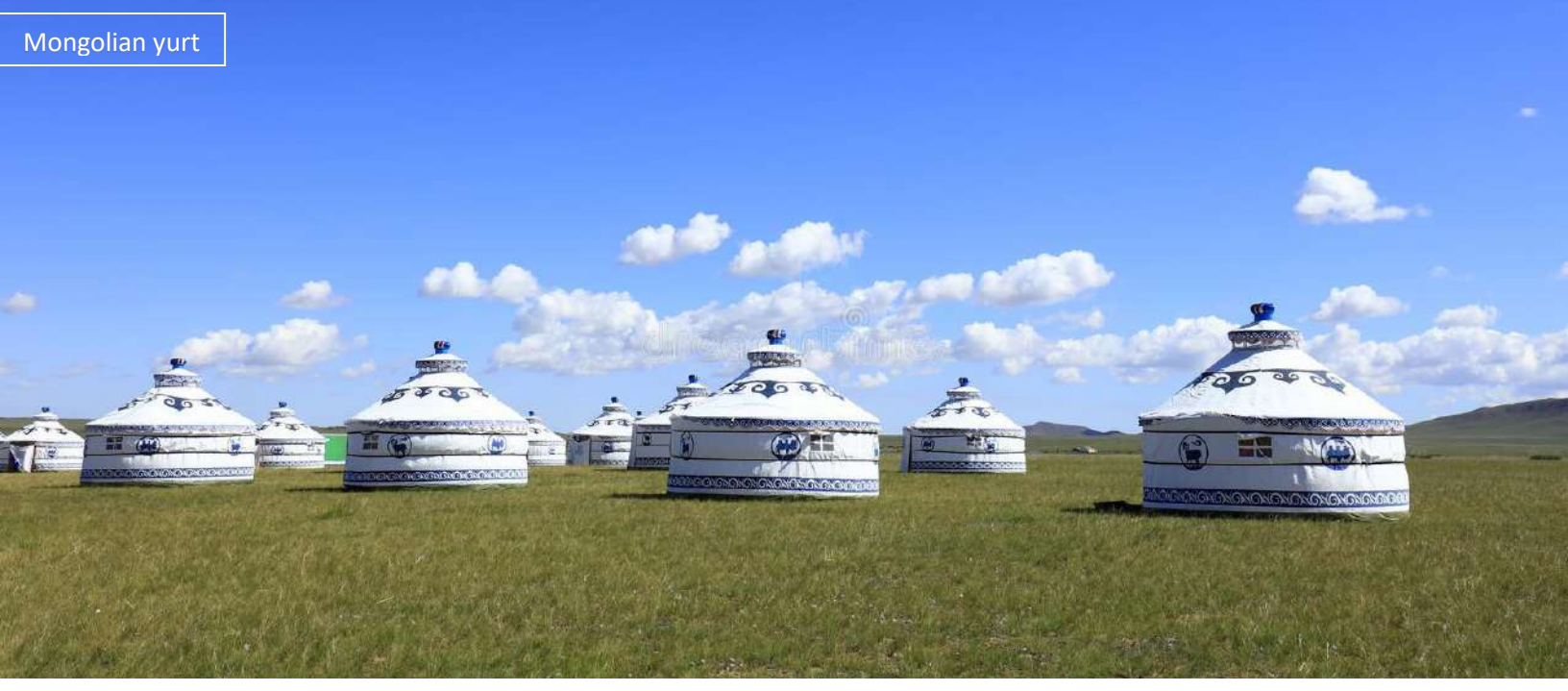
Day 4: Irkutsk - Buryatia - Olkhon Island 伊尔库兹克 - 布里亞特 - 奥利洪岛

After Breakfast, proceed to Buryatia village, learn about shamanism and Buddhism are central to the Buryat belief system, and here you will join the praying ceremony. Boarding cruise to Olkhon Island, there is a small stone protruding from the water. It is called "Shaman Stone", and there are many coins scattered on the river bed around its bottom. In ancient times, the local people believed that the shaman stone had magical powers, so ceremonies, sacrifices and mantras were often held around it to clarify false accusations or defend honor.