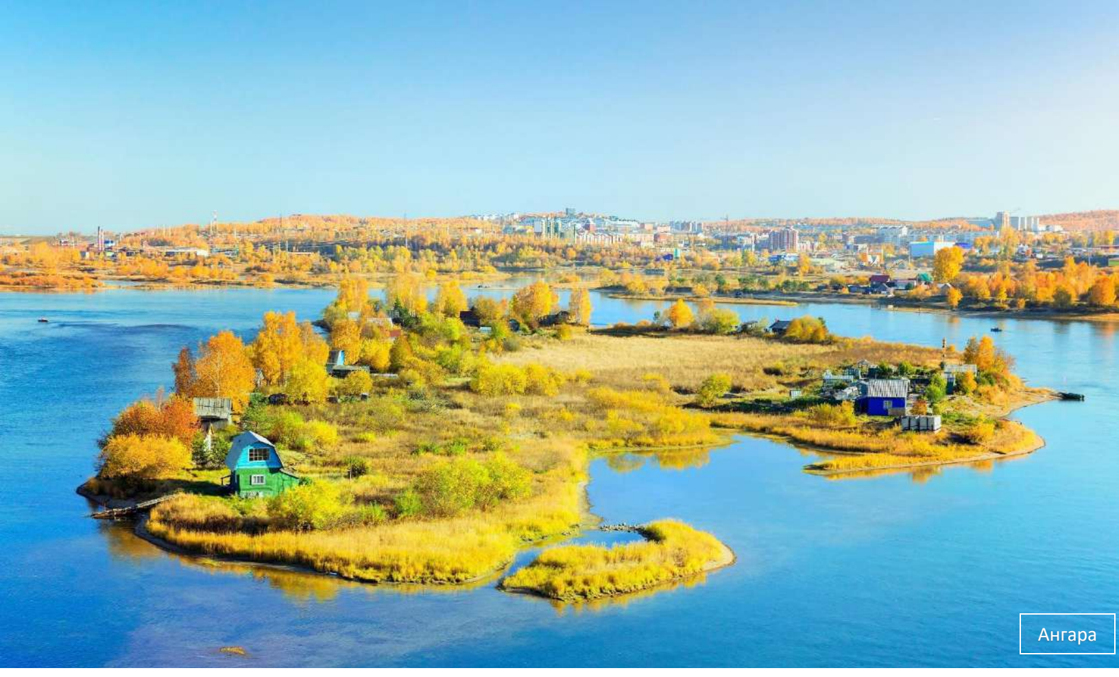
Day 7: Listvyanka – Irkutsk - Ulaanbaatar 利斯特维扬卡 – 伊尔库兹克 - 乌兰巴托

After breakfast, visit to Baikal Museum, the only museum which entirely devoted to the history of Lake Baikal exploration, its flora and fauna. visit to the mountain Chersky by chair lift where you can admire beautiful landscapes of Southern Baikal and source of Angara River. Continue to Spasskaya Church, one of the oldest rock churches in Irkutsk. Proceed to city tour including of Triumphal Arch Moscow Gates, bronze statue of the Siberian pioneers, Bogoyavlensky Cathedral and Ангара, you can enjoy the most beautiful view here. Transfer to airport for domestic flight to Ulaanbaatar.