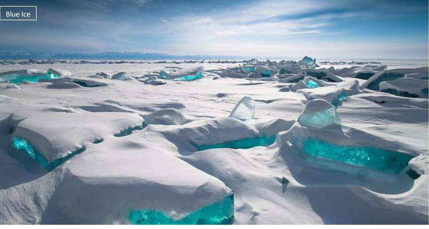
Day 1: Arrive Ulaanbaatar (UBN) 抵达乌兰巴托

On arrival at Chinggis Khaan International Airport, transfer to city center and proceed for city tour. Visit Gandantegchinlen Monastery, its name means" the big place of complete joy". Proceed to Zaisan Memorial, a huge communist-era propaganda monument and mural that offers stunning views of the Mongolian capital. Continue to theater enjoy Mongolian Culture and Heritage show with Mongolian music and dance, overtone singing, known as höömii (throat), use a Morin Khuur (horse-head fiddle) as accompaniment, sometimes with a type of indigenous flute named limbe to present the beauty of Mongolian life. Transfer to hotel for dinner and check in.