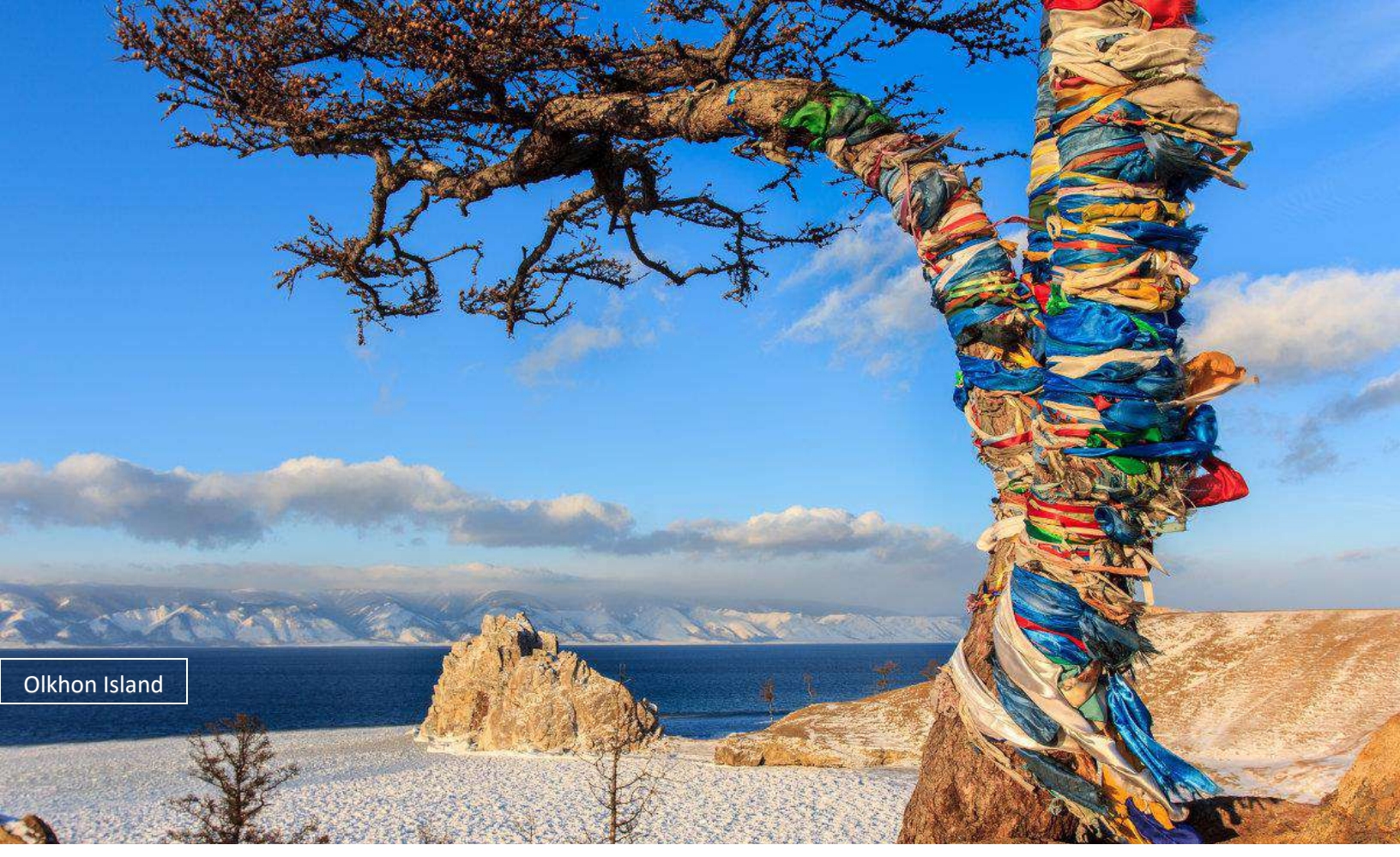
Day 6: Olkhon Island – Listvyanka (4 hours) 奥利洪岛 - 利斯特维扬卡

After breakfast, on board Lake Baikal cruise tour, the opportunity to observe seals, see the Islands and wild shores where there is no way to travel by land. Proceed to Listvyanka, the closest lakeside village to Irkutsk, Listvyanka – aka the 'Baikal Riviera' – is the touristy spot where most travelers go to dunk their toes in Baikal's pure waters. Visit to fish market, more of a combination fish/souvenir/snack market, in all honesty.