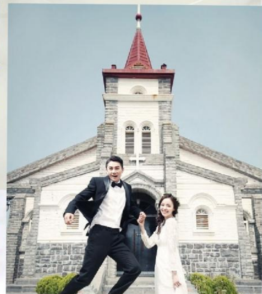
Jukseong Dream Cathedral Basic Dress