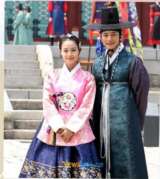
Yongdusan Park Hanbok Dress