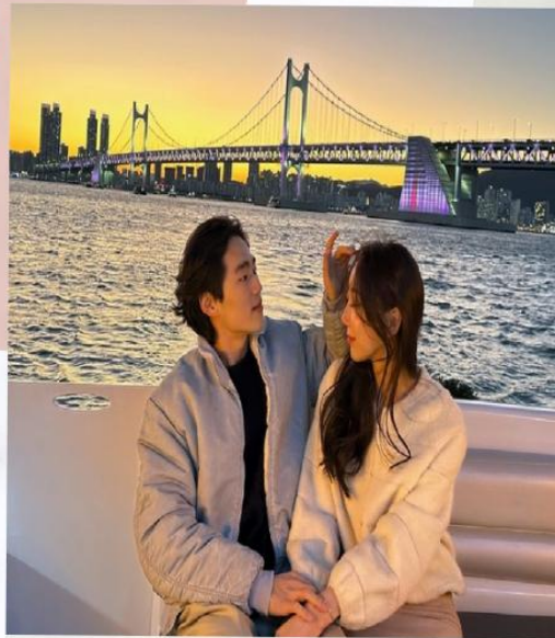
The Bay 101 Daily Clothes!