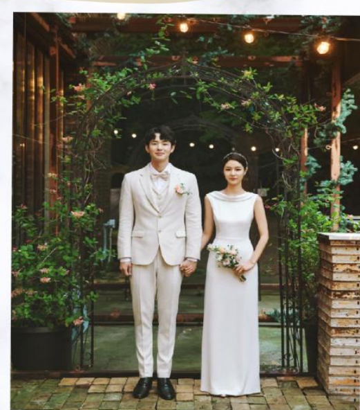
Labella Chita Basic or Semi Dress