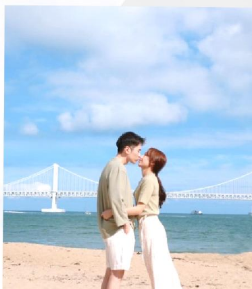
Gwangalli Beach Casual Couple Look