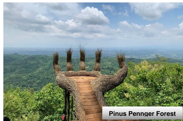
Pinus Pennger Forest