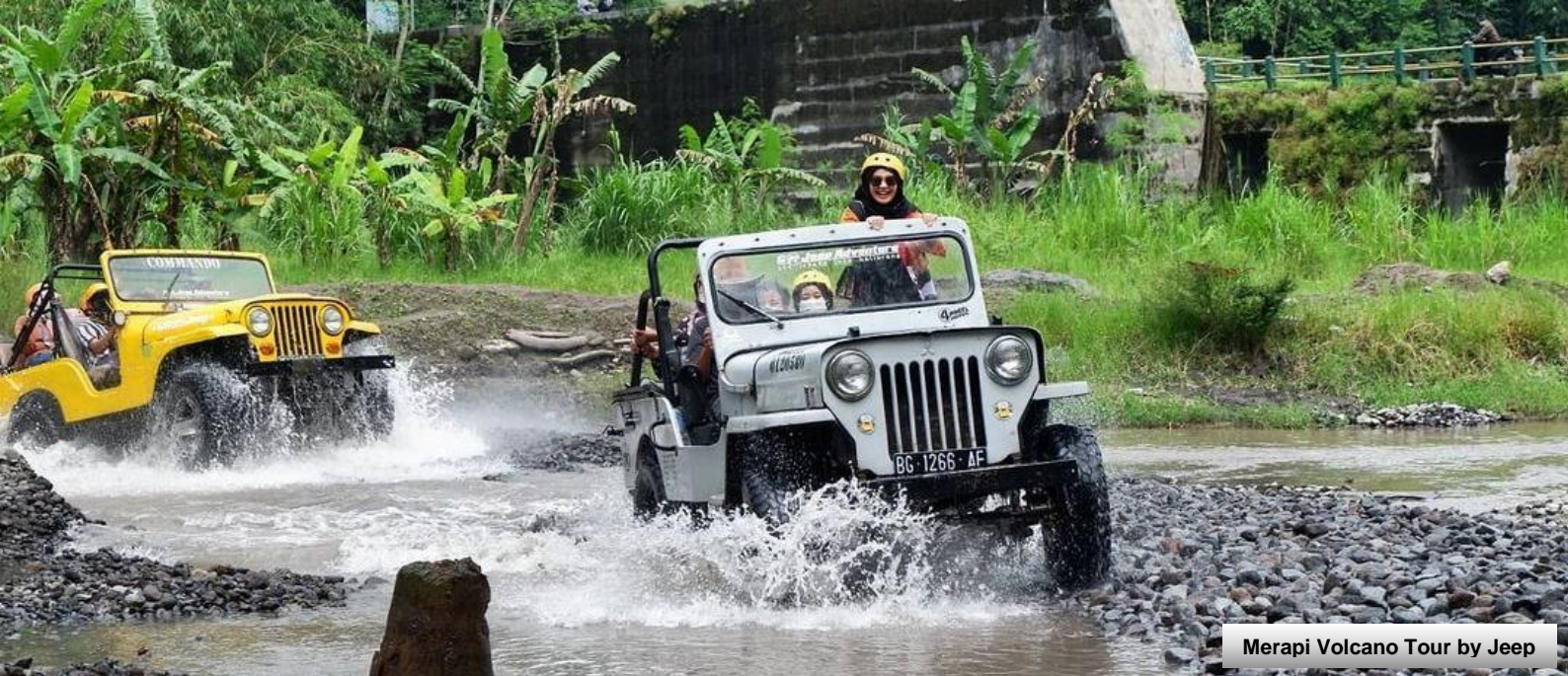
Merapi Volcano Tour by Jeep