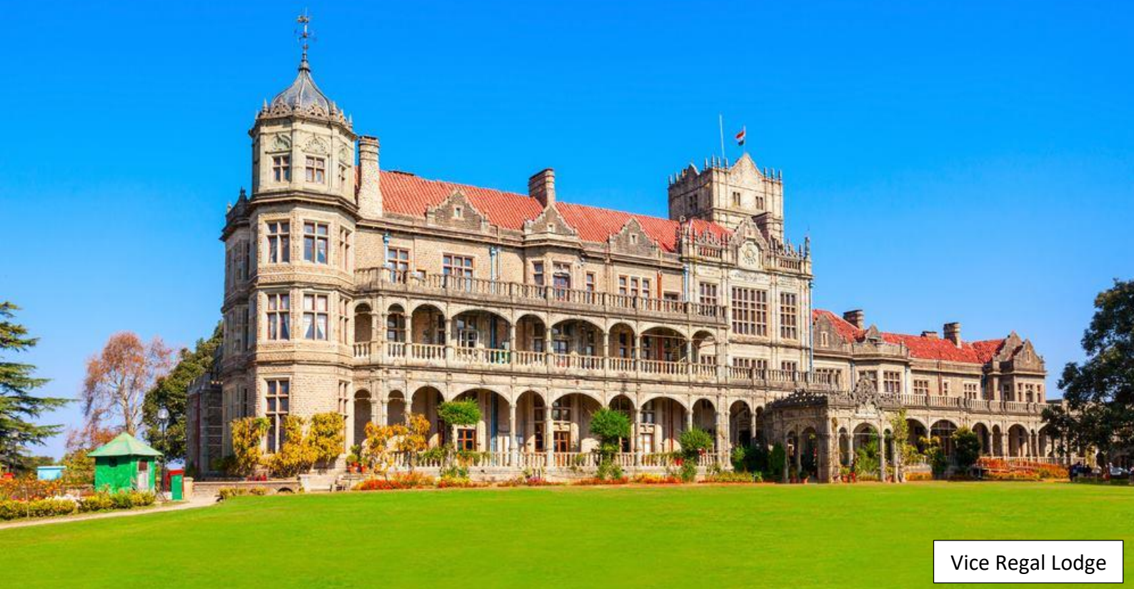
Vice Regal Lodge

Morning visit Shimla. The Mall: All visitors to Shimla inevitably walk down the Mall, the main promenade that runs along the top of the ridge - a busy shopping area with old colonial buildings, souvenir shops and restaurants. Narrow cobble-stoned paths wind down to the middle and lower bazaars where tribals from the hills around gather to sell their quaint and colorful artifacts. At the top end of the Mall is the Scandal Point, a large open square with a view of the town - a favorite rendezvous for visitors and the local people.