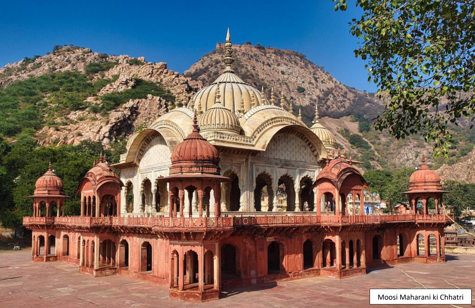
Moosi Maharani ki Chhatri