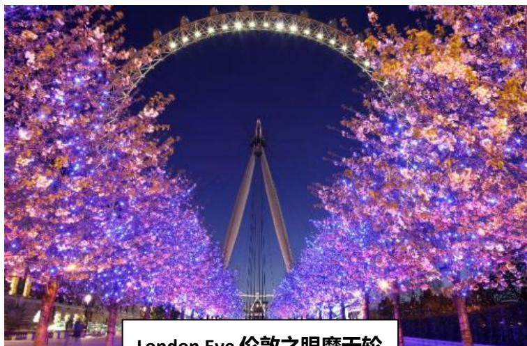
London Eye 伦敦之眼摩天轮