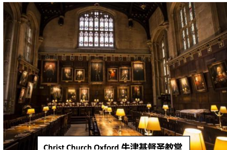
Christ Church Oxford 牛津基督圣教堂