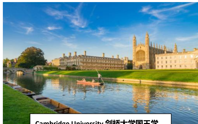
Cambridge University 剑桥大学国王学院