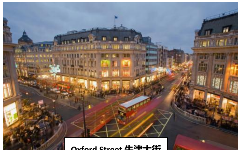
Oxford Street 牛津大街