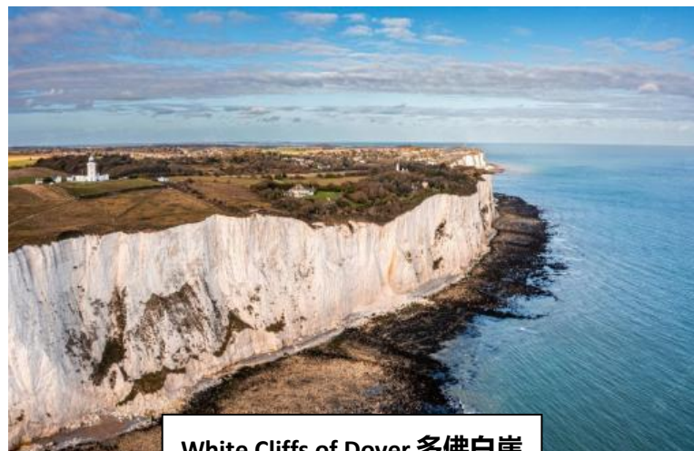
White Cliffs of Dover 多佛白崖