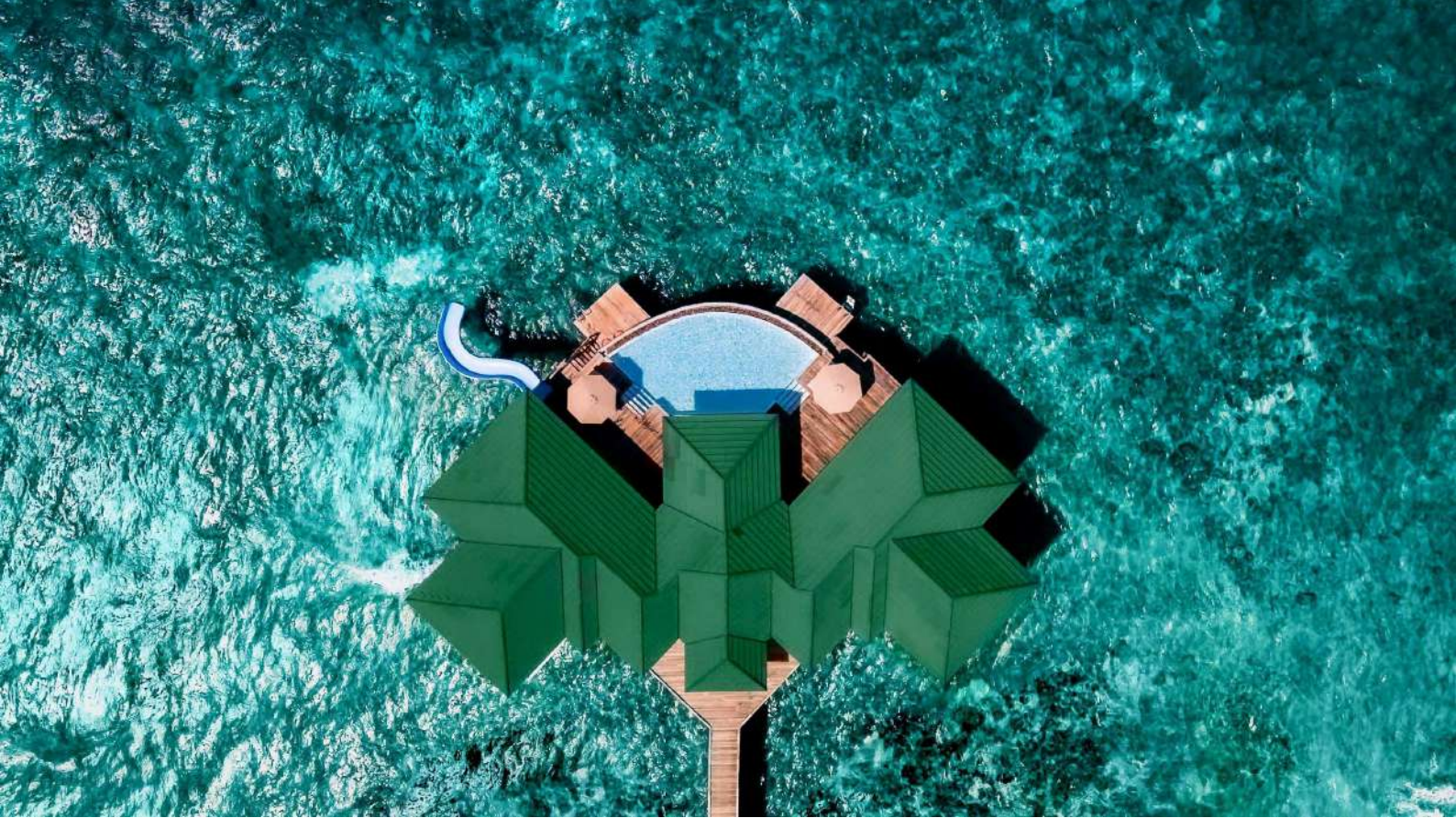
DAY 04: KANDY - COLOMBO - MALDIVES 康提 - 科伦坡 - 马尔代夫 (180KM - 3HRS - 50MIN) (B/L/D)

Breakfast at the hotel. Check-out 酒店早餐后,退房