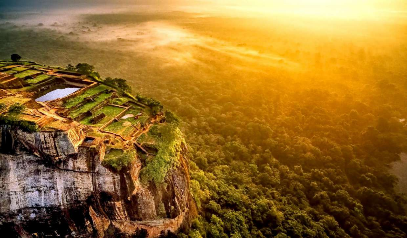
DAY 01: ARRIVAL COLOMBO - NEGOMBO 抵达尼甘布 (10KM - 20MIN) {CMB} (L/D)

Arrival at Colombo International Airport, meeting and assistance. Then transfer to Negombo 抵达科伦坡国际机场,会面并提供协助然后转移到尼甘布