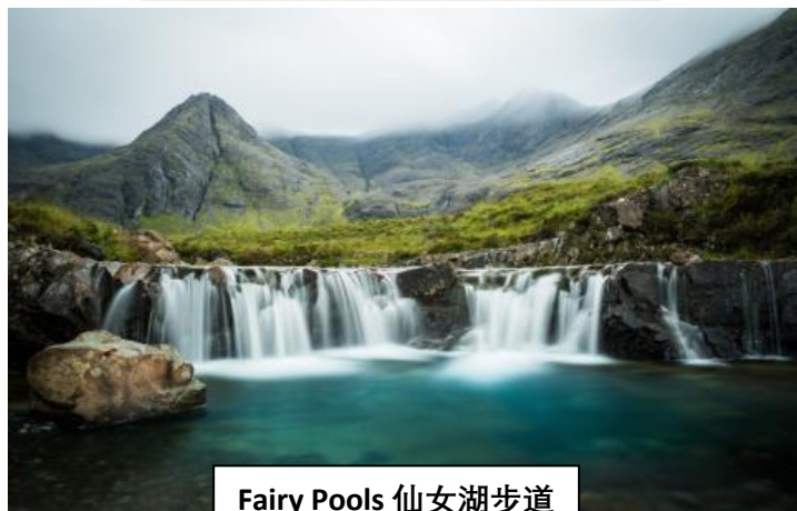
Fairy Pools 仙女湖步道