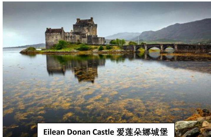
Eilean Donan Castle 爱莲朵娜城堡