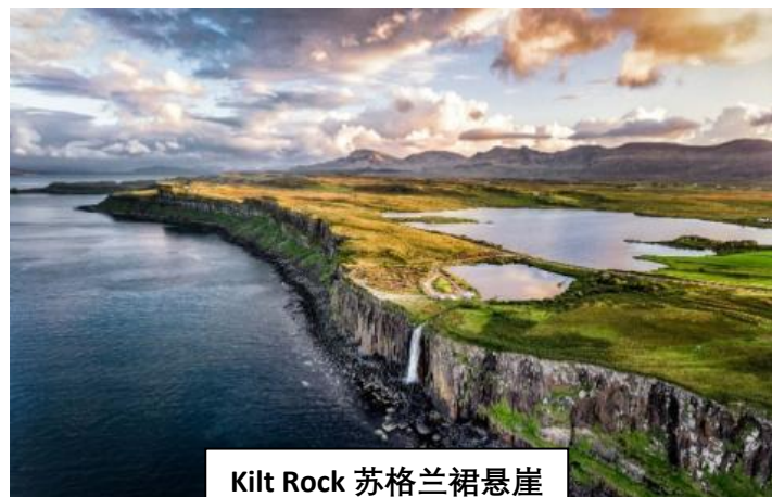
Kilt Rock 苏格兰裙悬崖