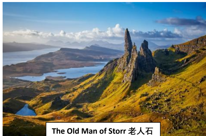
The Old Man of Storr 老人石