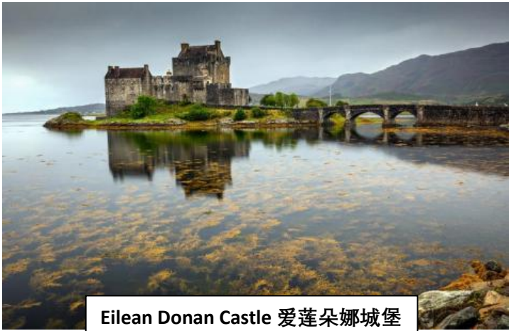
Eilean Donan Castle 爱莲朵娜城堡