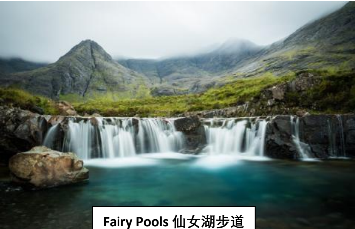
Fairy Pools 仙女湖步道