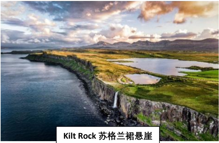
Kilt Rock 苏格兰裙悬崖