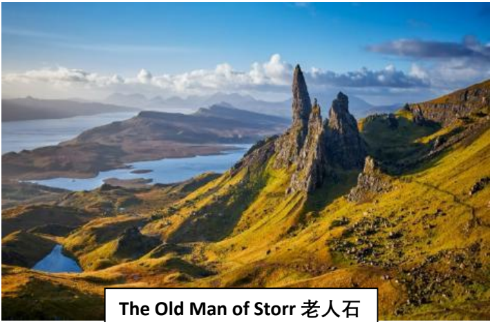
The Old Man of Storr 老人石