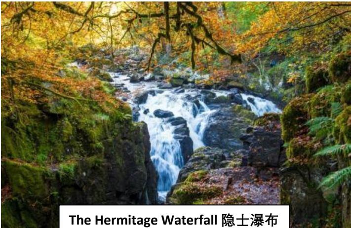
The Hermitage Waterfall 隐士瀑布

苏格兰人称之为童话小镇，流经小镇的塔姆尔河波澜不惊，曲曲弯弯地静静流淌着，这里最有名的是水坝和鲑鱼台阶，34 个独立水池顺坡而建，便于产卵季节的鲑鱼拾阶而往上游产卵。这里的建筑带有明显的维多利亚时期的风格，据说 1842 年维多利亚女王来小镇视察时提过不少规划建议，后又通了小火车，不久小镇就扬名于大不列颠。