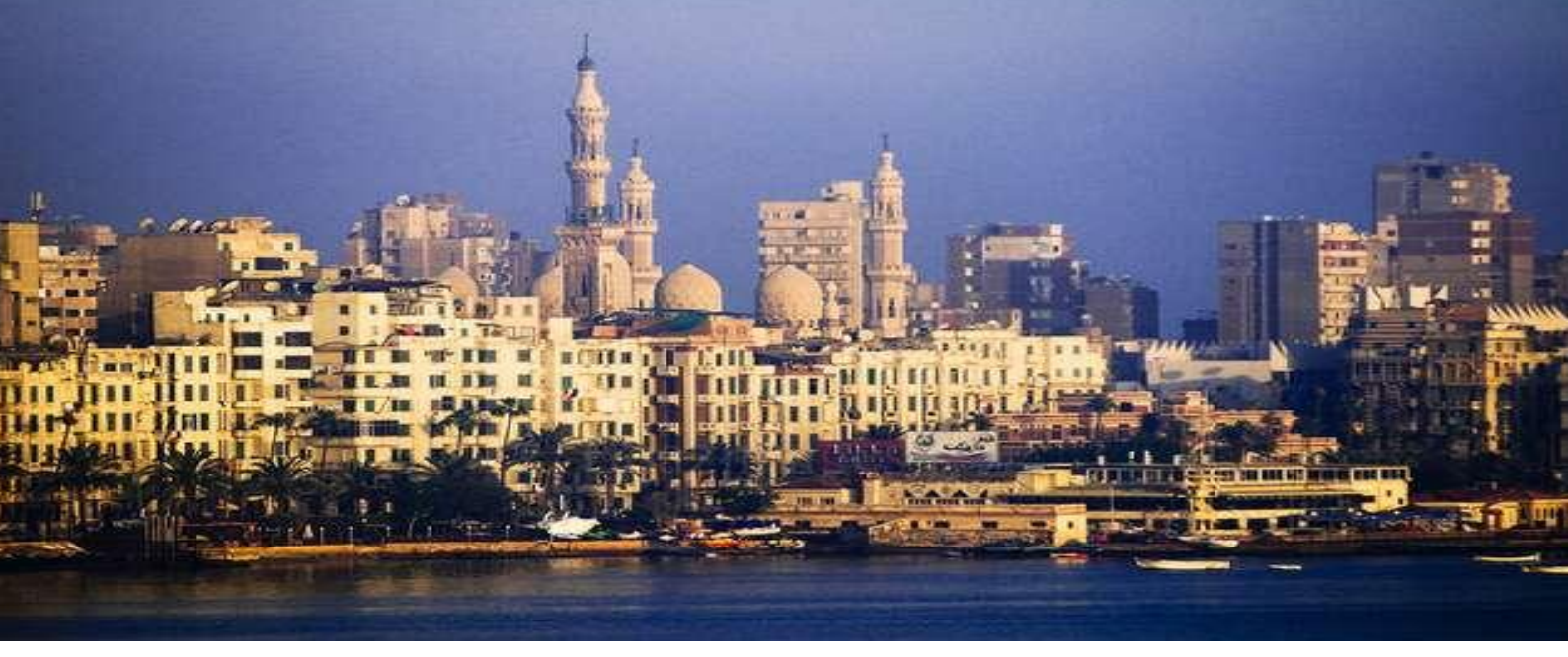
Day 3- Cairo 16.8km- St Catherine 11km - Sinai 开罗-圣凯瑟琳-西奈 (B/L/D)

After breakfast, proceed to St Catherine –Sinai (10-12 hours) through the tunnel of Ahmed Hamdynear to Suez city which goes under the Suez Canal which connecting the red sea with the Mediterranean Sea then you will stop by Moses Springs (OyounMusa) and you will know a lot about Moses and the Exodus.Arrival to your hotel, dinner and overnight. 早餐后,前往圣凯瑟琳-西奈(10-12 小时,通过 Ahmed Hamdynear 隧道到达苏伊士市,在苏伊士运河下连接红海和地中海,然后您将在摩西泉停留你会知道很多关于摩西和出埃及记的事情.抵达您的酒店,享用晚餐并过夜.