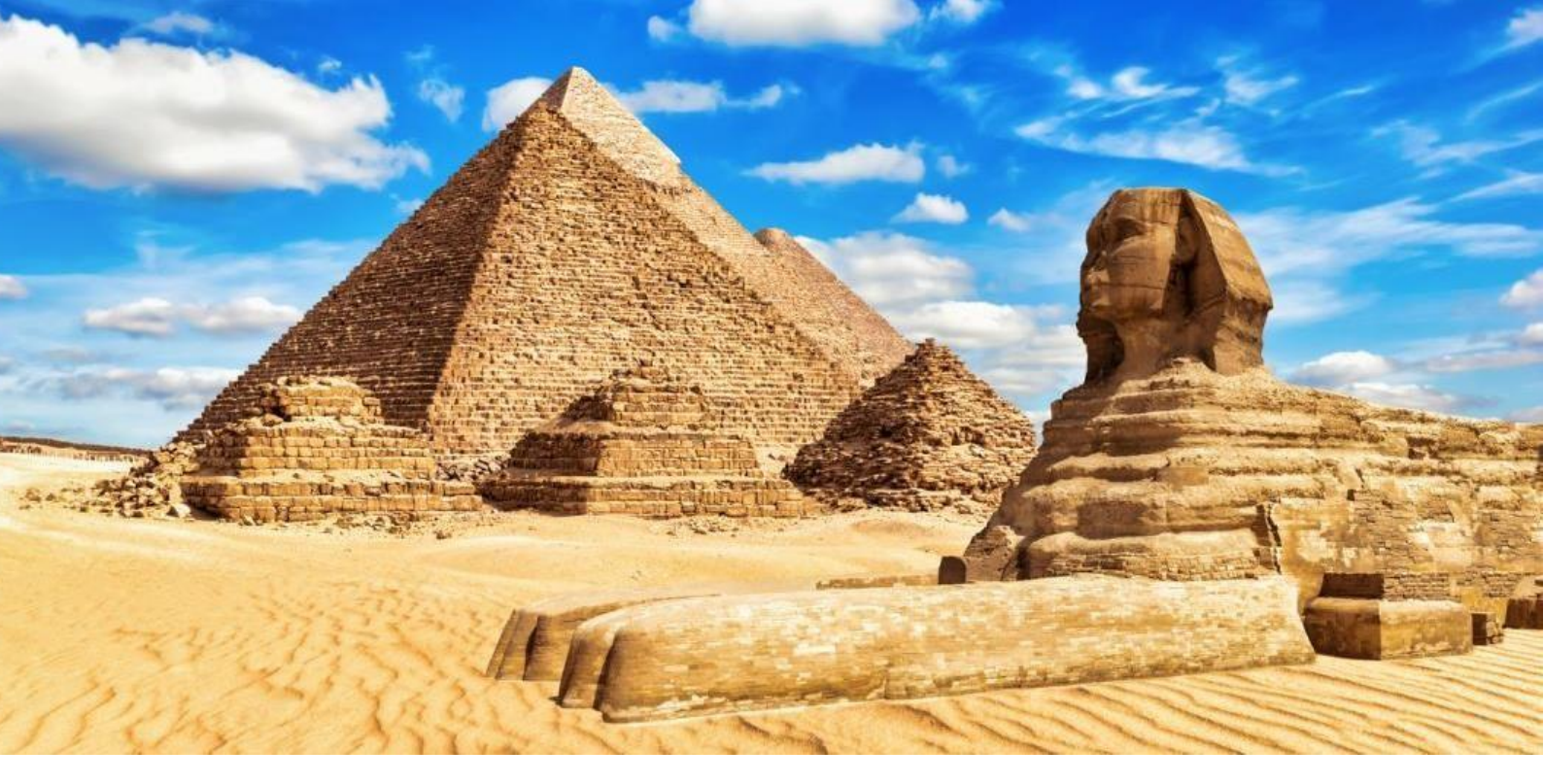
Day 1- Arrival Cairo 44.8km- Hotel - Dinner {CAI}

Upon arrival Cairo international airport, you will be welcomed by our representative and transfer to hotel. 抵达开罗国际机场后,我们的代表将迎接您并转移到您的酒店。