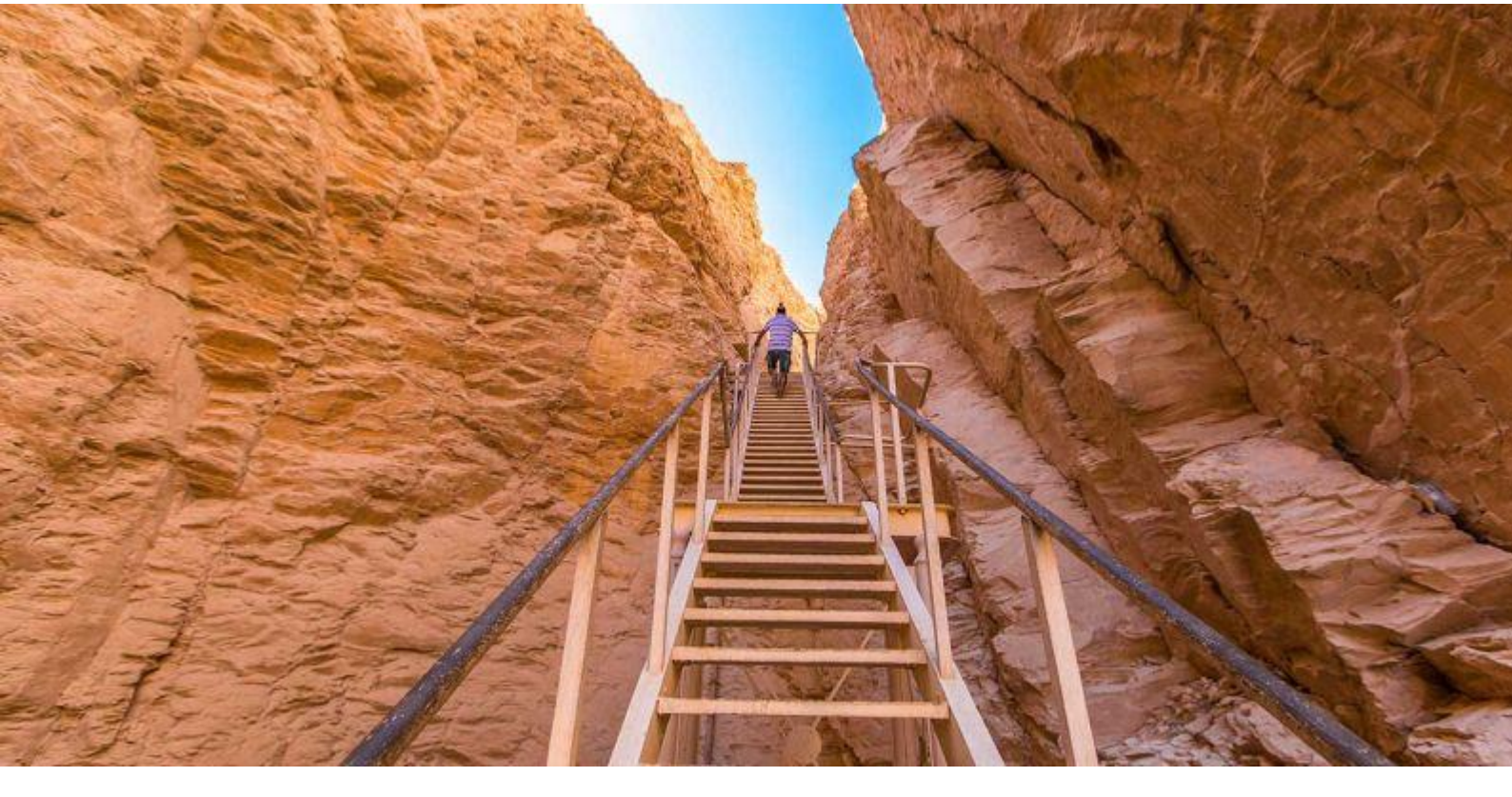
Day 5- Luxor - Kings Valley-Temple of Queen Hatshepsut - Colossi of Memnon (B/L/D)

After breakfast, drive to the west bank of the Nile and visit The Valley of the Kings where, for a period of nearly 500 years from the 16th to 11th century BC, tombs were constructed for the Pharaohs and powerful nobles of the New Kingdom (the Eighteenth to the Twentieth Dynasties of Ancient Egypt). The valley stands on the west bank of the Nile, opposite Thebes (modern Luxor), within the heart of the Theban Necropolis.