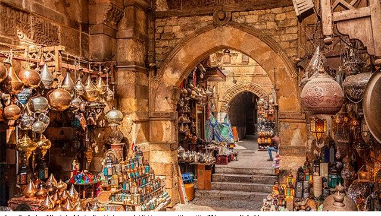
Day 7- Cairo Citadel of Saladin, Mohamed Ali Mosque - Khan Khalili bazaar (B/L/D)

After breakfast start our tour visiting the Citadel of Saladin & Mohamed Ali Mosque.