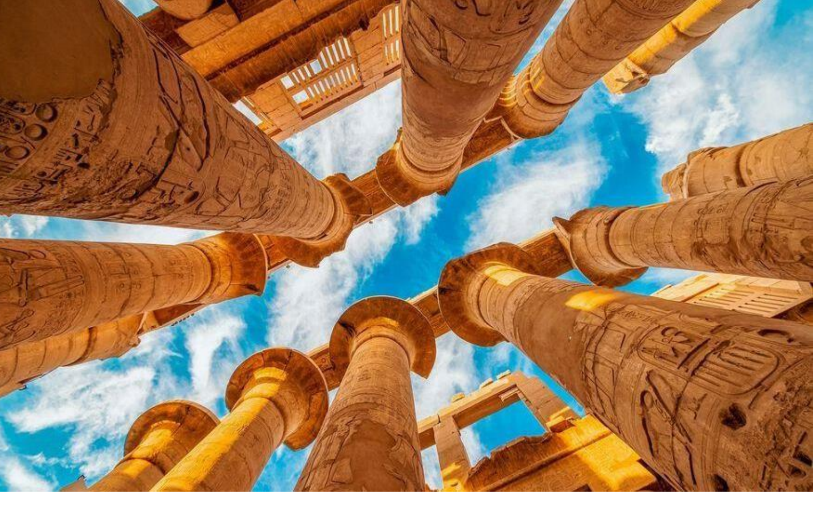
Day 6- Luxor 5km - Karnak Temple, Luxor Temple, fly to Cairo (B/L/D)

After breakfast, disembarkation, visit the Karnak temple which comprises a vast mix of decayed temples, chapels, pylons, and other buildings. Building at the complex began during the reign of Senusret I in the Middle Kingdom and continued into the Ptolemaic period, although most of the extant buildings date from the New Kingdom the Karnak complex gives its name to the nearby, and partly surrounded, modern village of El-Karnak, 2.5 kilometers (1.6 miles) north of Luxor.