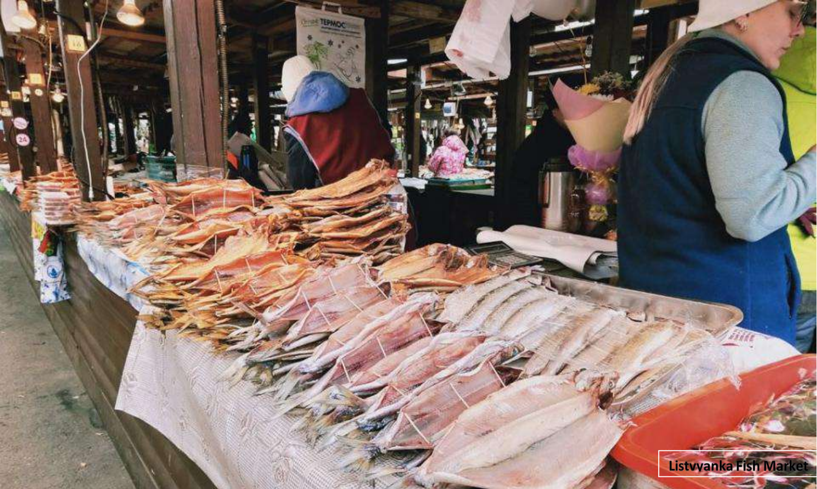
Listvyanka Fish Market