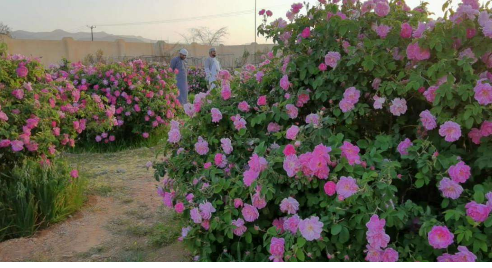
Day 4: Jabal Akhdar – Al Hamra 绿山 - 哈姆拉

After Breakfast, start the day from short walk and long hikes to military routes and trips to fruit, rose, and nut plantations. Along the Village walk & Saiq Plateau journey, you will be able to see how local people adapted to live in the mountain, the houses they leave in and the crop they cultivate. Drive to Wadi Bani Habib, with 5 minutes walking till the photo stop point with a breathtaking view to the Canyon. Proceed to Misfat Al Arbiyeen, a village that features incredible agricultural terraces, beautiful alleys, and old muds houses with palm frond roofs built on solid rock foundation.