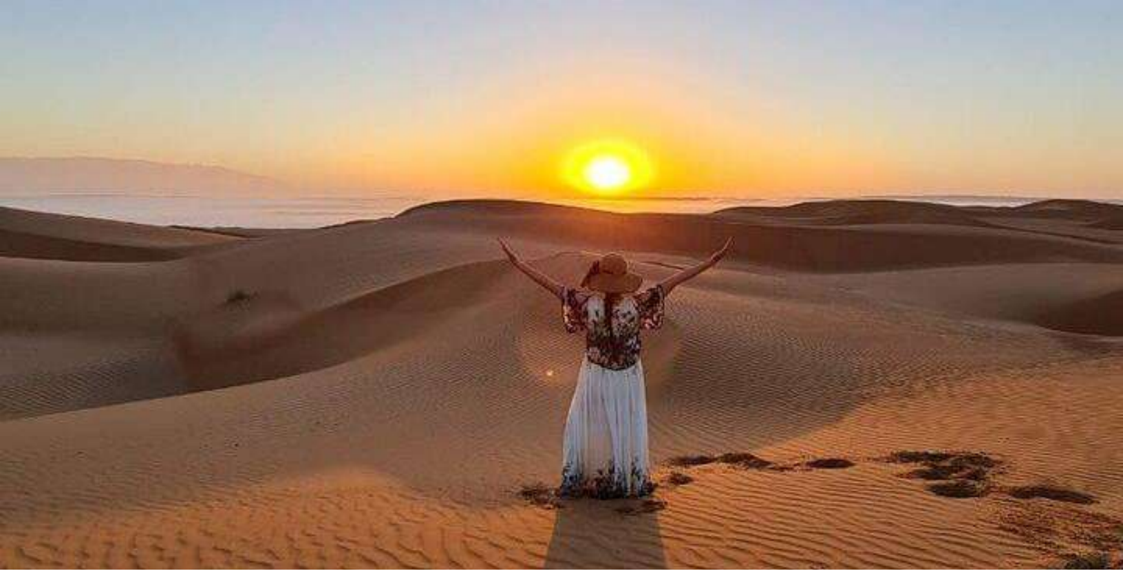
Day 5: Al Hamra – The Desert 哈姆拉 – 沙漠日落

After breakfast, transfer to small town of Bahla which is famous for its gigantic Fort listed as UNESCO Heritage site. Proceed to Jibreen Castle, the finest of Oman's castle built during the late 17th century. On the way to Wahiba Desert, you will get the unique opportunity to have lunch at a local Omani house and experience the true Omani hospitality. Next, experience unforgettable Dunes' bashing and lose yourself in the beauty of the ever-changing slopes of sands. The rest of the day will be dedicated to your rest at the camp with Sunset watching at the top of the dune.