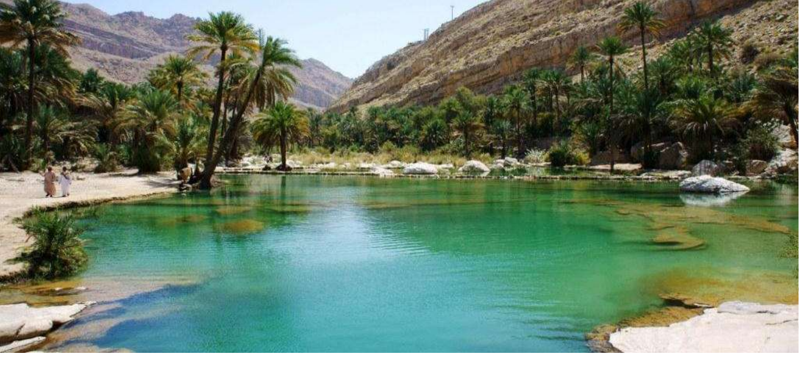
*Sequence of itinerary subject to arrangement*