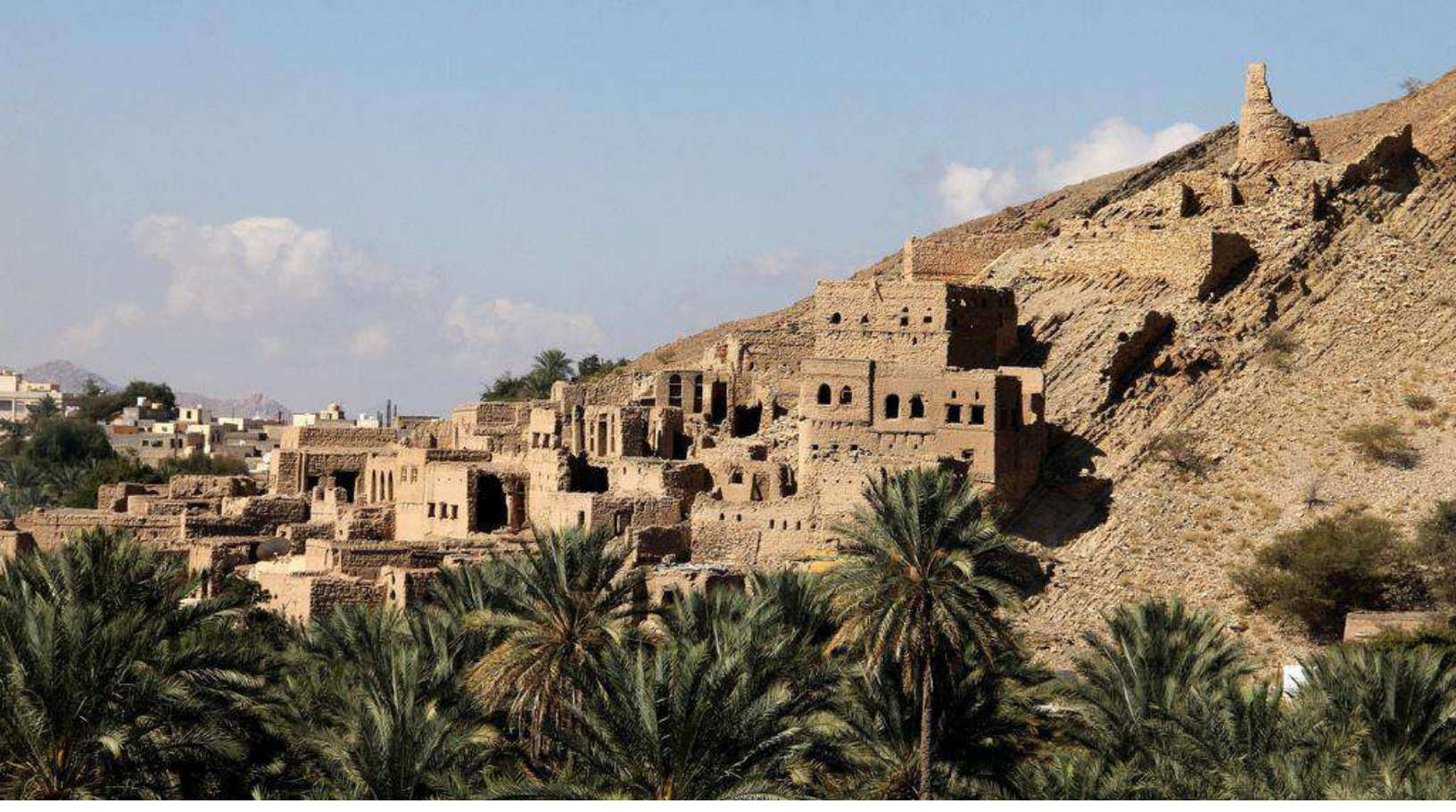
Day 3: Muscat – Nizwa – Jabal Akhdar 马斯喀特 - 尼兹瓦 – 绿山

After breakfast, transfer to Nizwa. Visit Amouage Perfume Factory — Omani national luxury worldwide famous perfume brand. Photo stop on the top point with a stunning view to Birkat Al Mouz — palm tree plantation with the ancient village with 500-years abundant houses. Here you will be able to observe UNESCO Heritage site 4000-years Falaj irrigation system which works till nowadays. visit the unique cattle market in Nizwa (on Fridays). Livestock owners, both women and men from nearby areas, bring their animals — mainly sheep, goats, cattle and at times even camels — to the market where they are registered. Visit the Nizwa Fort which has been strategically built atop a hill overlooking the ancient city with its colorful domes and bustling market below. Spend some time in this traditional city and visit the interesting fort with the round tower and the museum and stroll through the Nizwa Souq where you will be able to try National Oman sweet —freshly cooked Halwa, try different sorts of Omani dates and buy some western species.