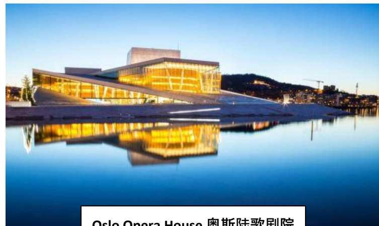
Oslo Opera House 奥斯陆歌剧院