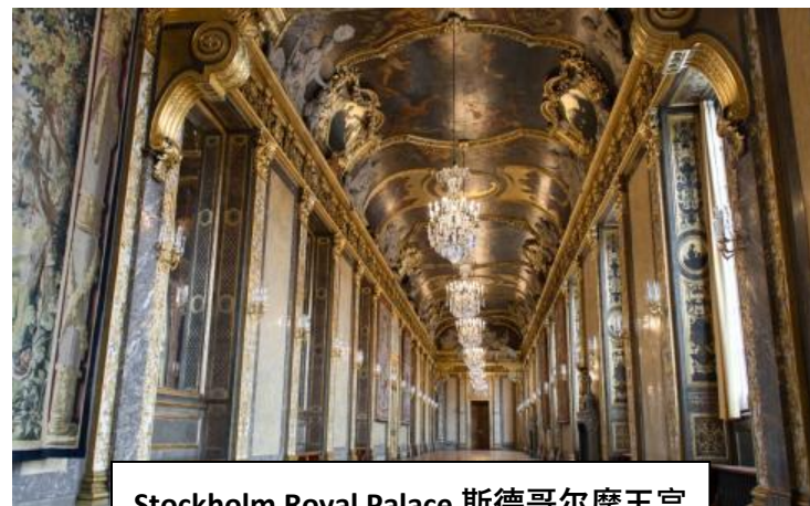
Stockholm Royal Palace 斯德哥尔摩王宮