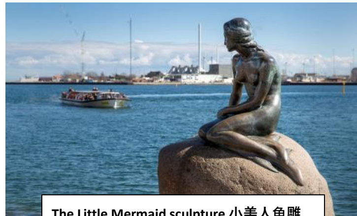
The Little Mermaid sculpture 小美人鱼雕