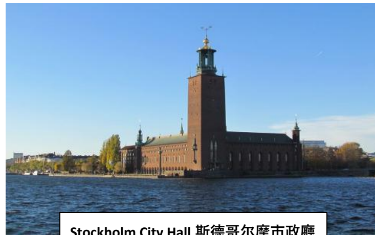
Stockholm City Hall 斯德哥尔摩市政廳