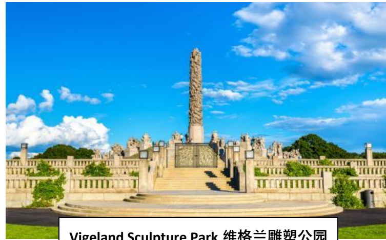
Vigeland Sculpture Park 维格兰雕塑公园