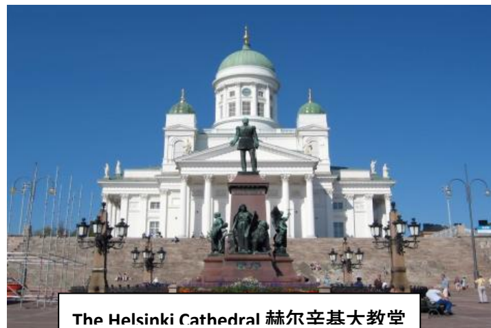
The Helsinki Cathedral 赫尔辛基大教堂