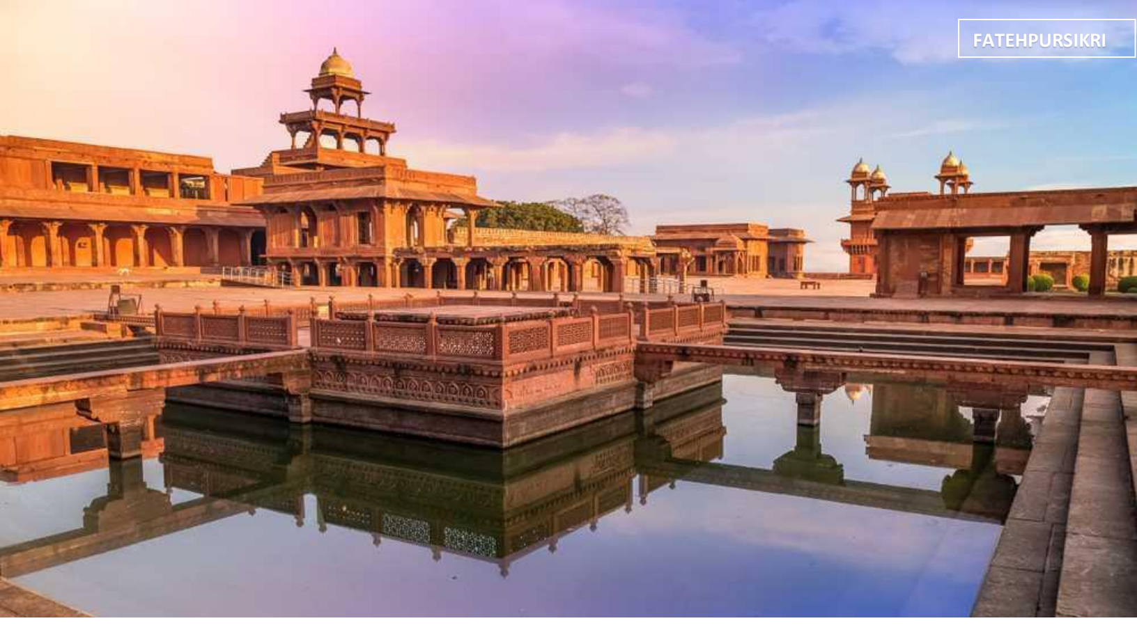
Day 4: Jaipur – Agra (240km) 斋浦尔 - 阿格拉

After breakfast, head to Agra, enroute visit to "FETEHPUR SIKRI" made of red sandstone and combines both Hindu and Muslim architecture. sprawling structure is made of red sandstone and combines both Hindu and Muslim architecture. The main entrance to this walled city is through the 175 feet Buland Darwaza. Continue to visit the Agra Fort. The high red stone monument stretches for around 2.5 kms, dominating a bend in the river Yamuna northwest of the Taj Mahal. The palace is a notable for its smooth blending of Hindu and central Asian architectural styles. Amongst the fascinating areas visited inside the fort; one if the Mussaman Burj, a two-storey pavilion, where Shahjahan was imprisoned by his son Aurangzeb in his old age. (TAJ MAHAL IS CLOSED ON FRIDAYS).