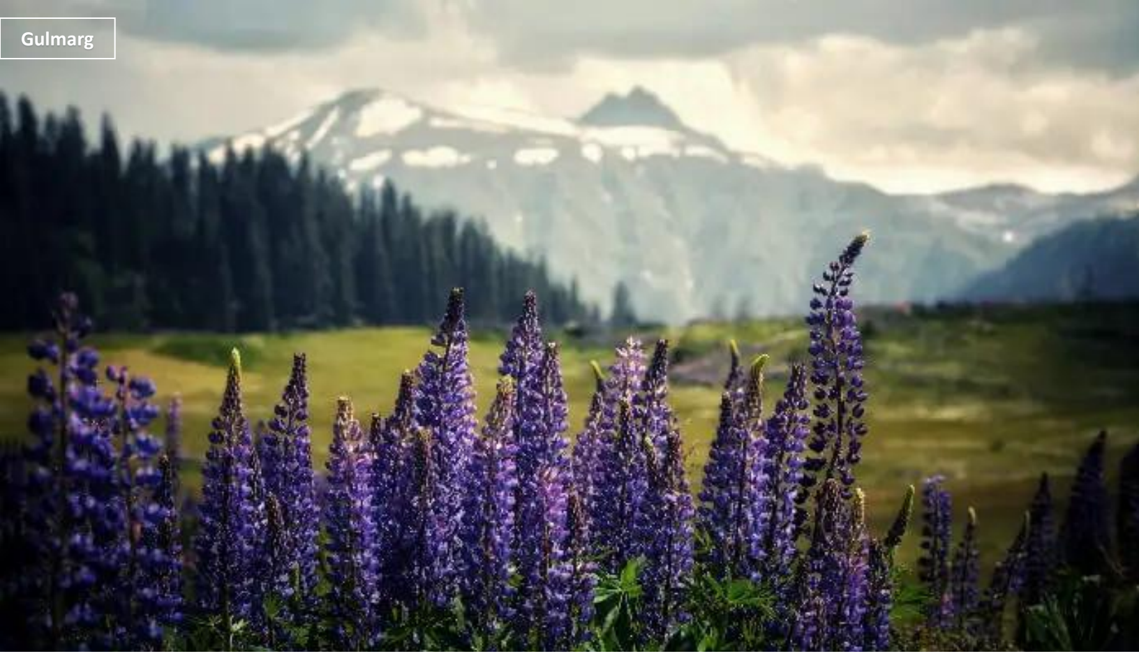
Day 7: Srinagar - Gulmarg - Srinagar 斯利那加 - 古尔马尔格 - 斯利那加

After breakfast, transfer from Srinagar to Gulmarg (no vehicle is allowed for local Running in Gulmarg). Gulmarg) known as 'Meadow of flowers" Discovered by the Kashmiri romantic poet in the 16th century who was inspired with its grassy slopes covered with wild flowers. It also turns into India's premier Ski resort in winter. On board Cable Car Ride to Phase II, the Gondola Cable Car offers rides to the upland meadows of Kongdori and beyond to the top of Apharwat range to a height of 14000 ft for viewing the Himalayan Peaks in summer and for downhill skiing in winter.