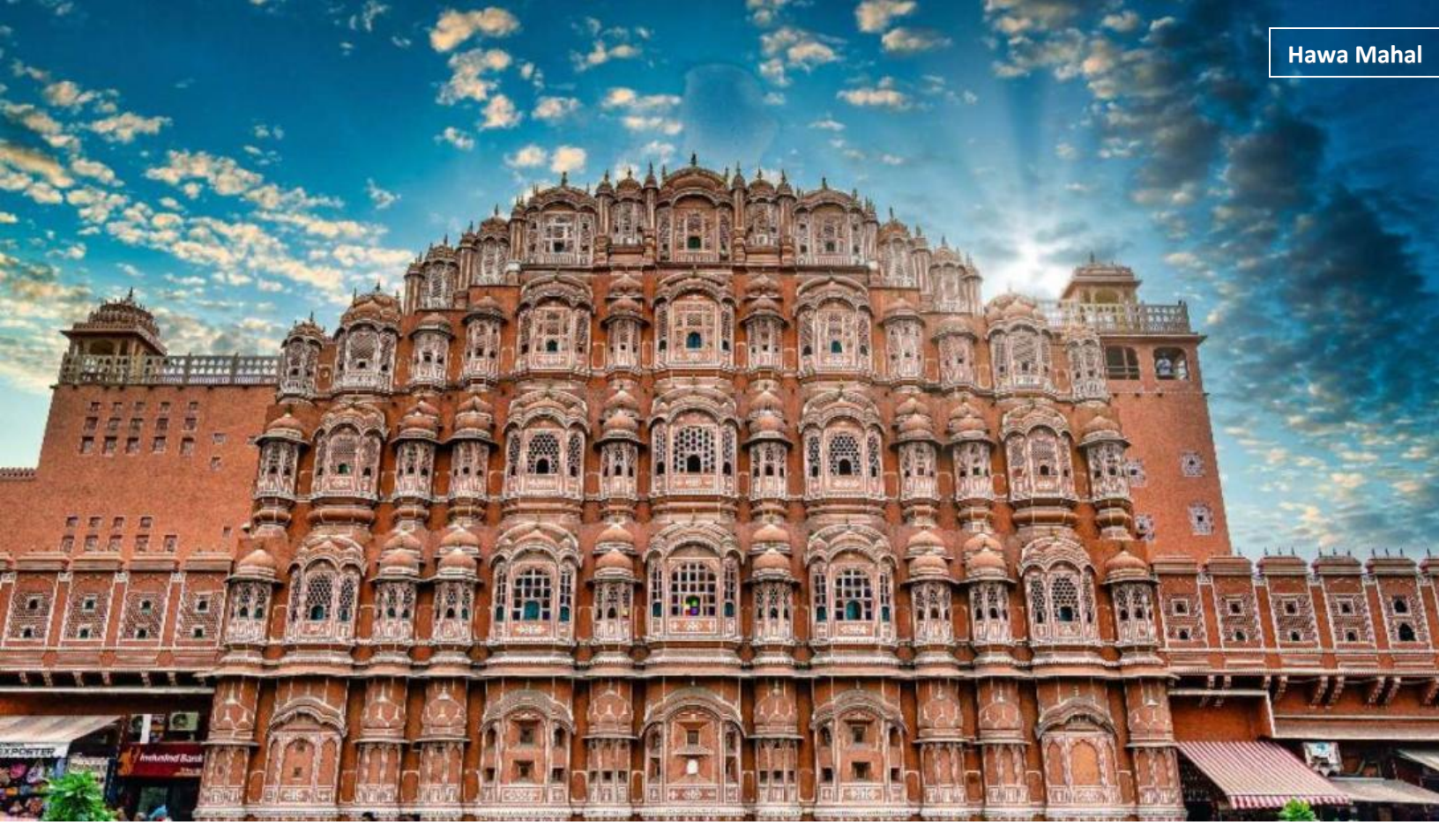
Day 3: Jaipur 斋浦尔

After breakfast visit of Amber Fort. En-route to Amber Fort, photo stop at Hawa Mahal - the Palace of Winds. Amber is a classic, romantic Rajasthani Fort Palace. Precious stones and mirrors are embedded into the plaster. Enjoy a jeep ride up to Fort Entrance. Visit the Jag Mandir or the Hall of Victory. Continue with Jaipur city tour, visit to the Maharaja's City Palace, the former Royal residence, part of it converted into a museum. One of the major attractions in the museum is the portion known as Armoury Museum housing an impressive array of weaponry-pistols, blunderbusses, flintlocks, swords, rifles and daggers. Later visit the Jantar Mantar, the largest stone and marble crafted observatory in the world. Continue to Birla Temple.