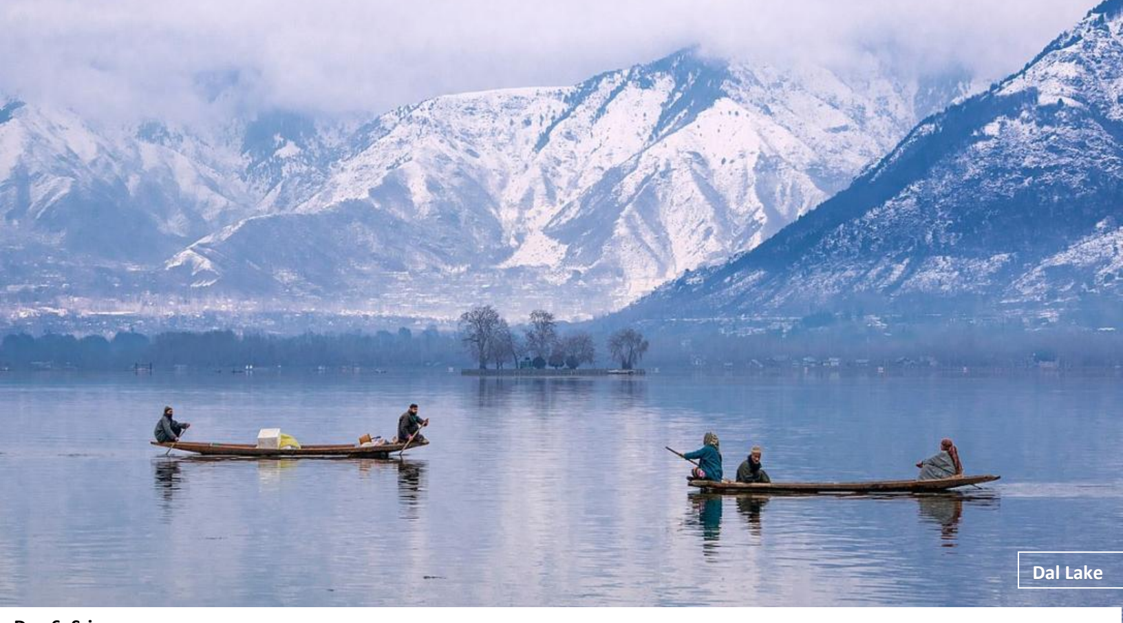
Day 6: Srinagar 斯利那加

After breakfast, full day city tour visiting Shalimar Garden known as 'Garden of love' built in 16th century (1619) by Mughal King Jahangir for his beloved wife Noor Jahan or (Mehr-un-Nissa). Visit Nishat Garden known as 'Garden of pleasure' built in 16th century (1633) by Mughal King Asif Khan. The largest in size is the Shalimar Bagh, which is also located on the bank of the Dal Lake. 'Nishat Bagh' is Urdu, which means "Garden of Joy," "Garden of Gladness" and "Garden of Delight. Continue the journey to Shankaracharya Temple, situated on the top of the Shankaracharya Hill, also called Gopadari Hill. The temple dates back to 200 BC. The Shiv ling was placed inside during the Sikh period in nineteenth century and it became an active Hindu temple when regular services were conducted. Persian inscriptions are also found inside the temple. (Any Electronic devices/ Leather are not allowed in temple).