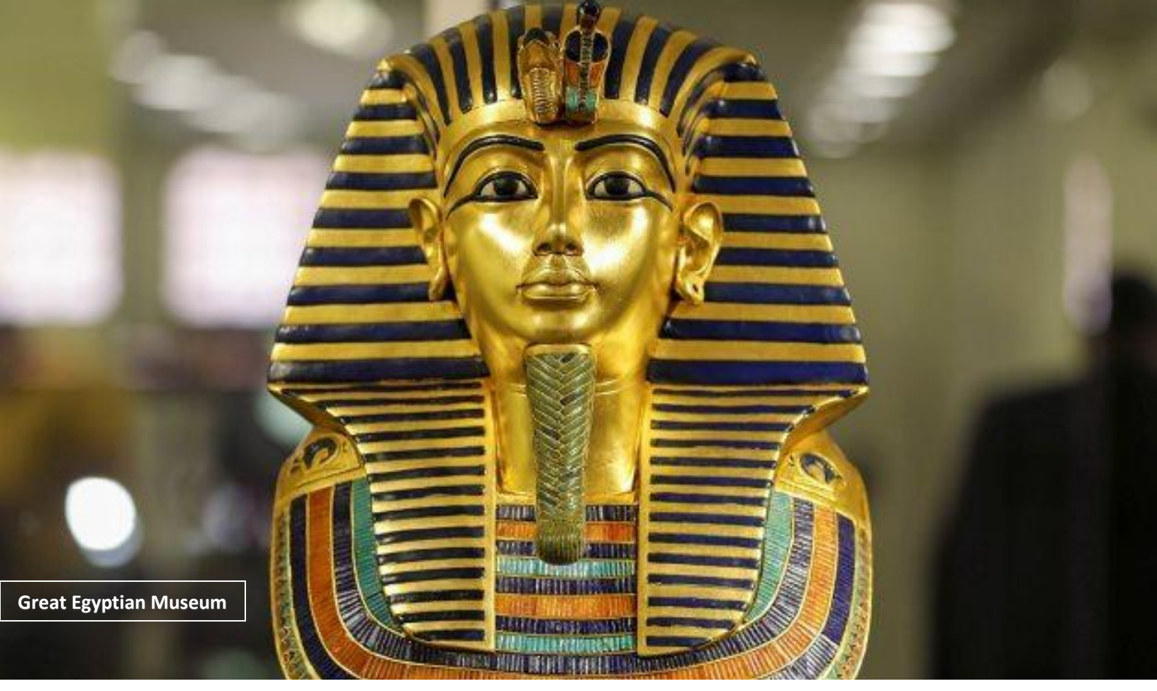
Day 6: Luxor - Cairo 卢克索 - 开罗 (B/L/D)

After breakfast, disembark and continue to sightseeing like Kings' valley, temple of Queen Hatshepsut and proceed to Alabaster factory. Visit to Colossi of Memnon, surviving for 3400 years and known as an acoustic wonder of the ancient world. Visit Karnak Temple, believed to have been an ancient observatory as well as a place of worship where the god Amun would interact directly with the people of earth. Visit to Luxor Temple, One of the main functions of the temple focused on the annual Opet festival, an event in which statues of Mut, Khonsu, and Amun would travel from Karnak to the temple. Transfer to Airport fly to Cairo.