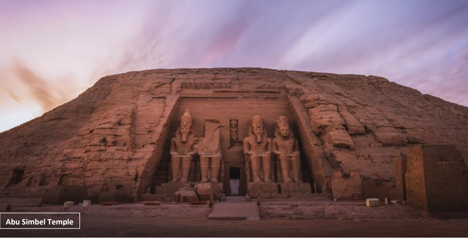
Day 4: Aswan – Abu Simbel - Kom Ombo - Edfu 阿斯旺 - 阿布辛貝勒神廟 - 康翁波 - 艾得夫 (B/L/D)

After breakfast, excursion to Abu Simbel, originally cut into a solid rock cliff, in southern Egypt and located at the second cataract of the Nile River. Sailing and visit to Temple of Kom Ombo, a double temple, dedicated to Sobek the crocodile god, and Horus the falcon-headed god. The layout combines two temples in one with each side having its own gateways and chapels. Sailing to Edfu and overnight.