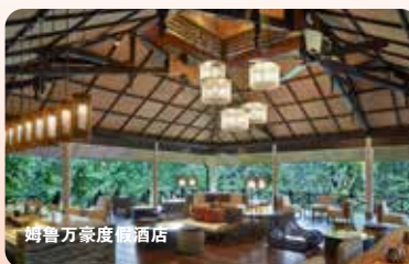
姆鲁万豪度假酒店

早餐后, 自由活动至退房送往姆鲁机场, 乘搭马航航班返回美里。抵达美里机场, 由导游接待前往餐厅用午餐。续参观美里加拿大山的马来西亚第一油井或大伯公庙、当地手工艺品中心以及美里市集。结束后送往美里机场, 搭乘国内航班返回吉隆坡。