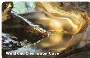
Wind and Clearwater Cave

Hotel: Mulu Marriott Resort & Spa (5 Star)