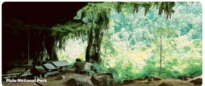
Mulu National Park

Hotel: Mulu Marriott Resort & Spa (5 Star)