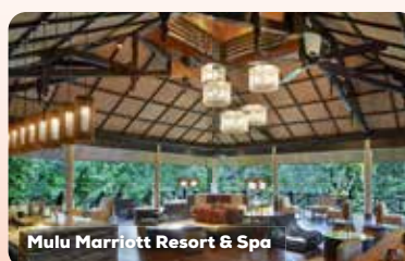
Mulu Marriott Resort & Spa

After breakfast, free and easy until check out & transfer to Mulu Airport for your flight back to Miri. Upon arrival at Miri, transfer for lunch at a local restaurant. After lunch, transfer for Miri City Tour which includes a visit to Malaysia's 1st Oil Well or The Grand Old Lady located at Canada Hill - Tua Pek Kong Temple, which is dedicated to the deity most beloved by local Chinese, Local Handicraft & Souvenir Centre and Tamu Khas – the native market, sell various tropical fruits & vegetables. Then, transfer to Miri Airport for flight back to Kuala Lumpur.