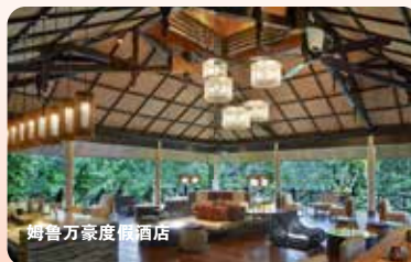
姆鲁万豪度假酒店

早餐后, 自由活动至退房送往姆鲁机场, 乘搭马航航班返回美里。抵达美里机场, 由导游接待前往餐厅用午餐。续参观美里加拿大山的马来西亚第一油井或大伯公庙、当地手工艺品中心以及美里市集。结束后送往美里机场, 搭乘国内航班返回吉隆坡。