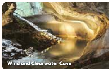
Wind and Clearwater Cave