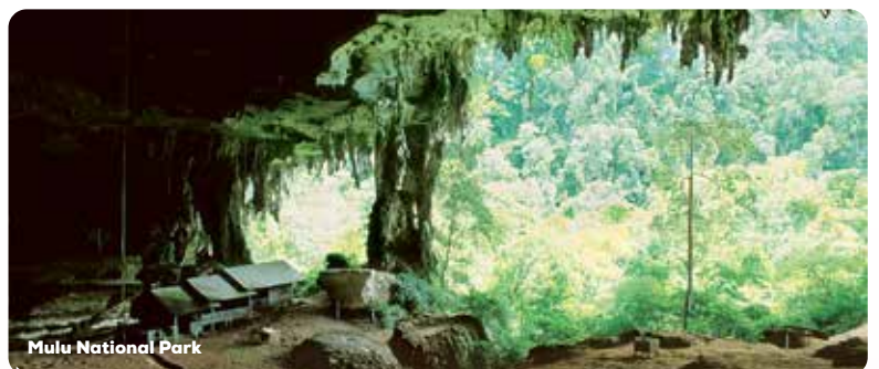
Mulu National Park

Hotel: Mulu Marriott Resort & Spa (5 Star)