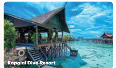
Kapalai Dive Resort