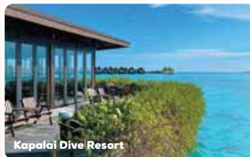
Kapalai Dive Resort