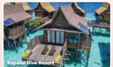
Kapalai Dive Resort