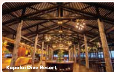
Kapalai Dive Resort