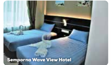
Semporna Wave View Hotel