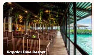
Kapalai Dive Resort