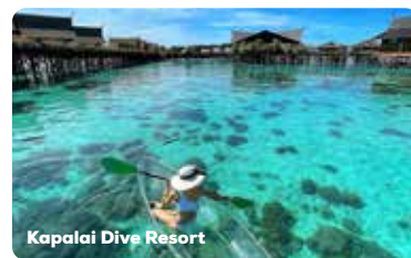
Kapalai Dive Resort