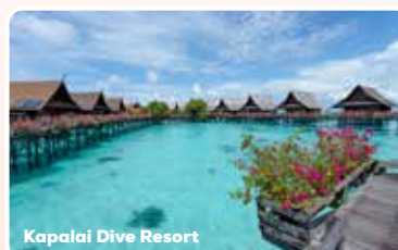
Kapalai Dive Resort