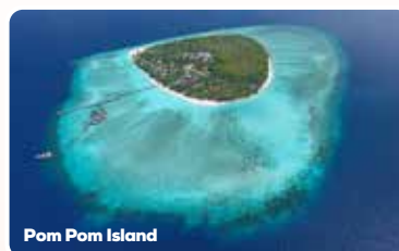
Pom Pom Island