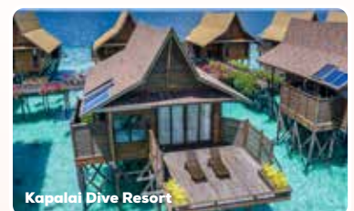
Kapalai Dive Resort