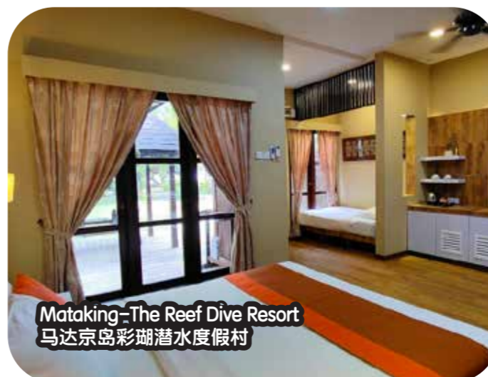
Matakings-The Reef Dive Resort 马达京岛彩湖潜水度假村