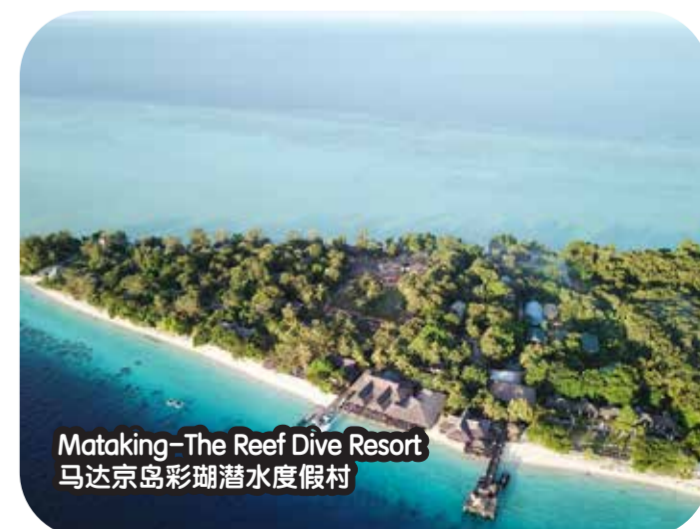
Mataking-The Reef Dive Resort 马达京岛彩瑚潜水度假村