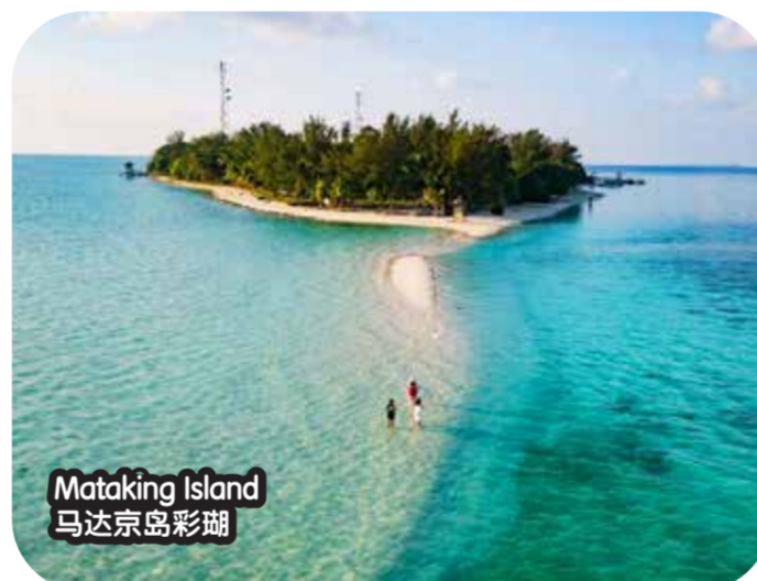
Mataking Island 马达京岛彩瑚