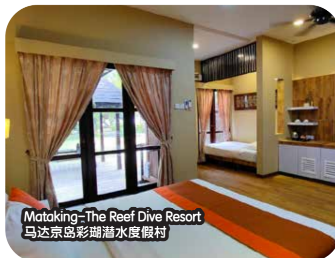
Mataking-The Reef Dive Resort 马达京岛彩瑚潜水度假村

*回程1800或以后的航班，于度假村享用午餐后，安排1400的快艇送往码头&送往机场