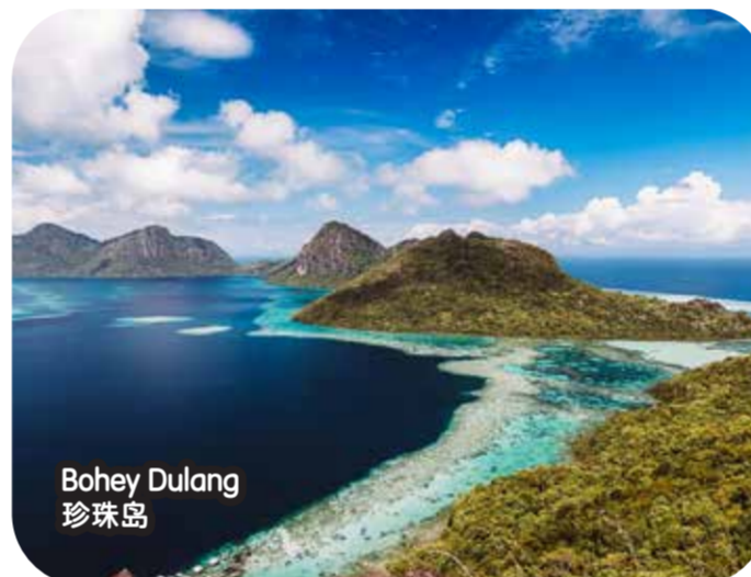
Bohey Dulang 珍珠岛

*For passengers with returning flight after 1800, boat transfer will be 1400, offer lunch at resort before departure