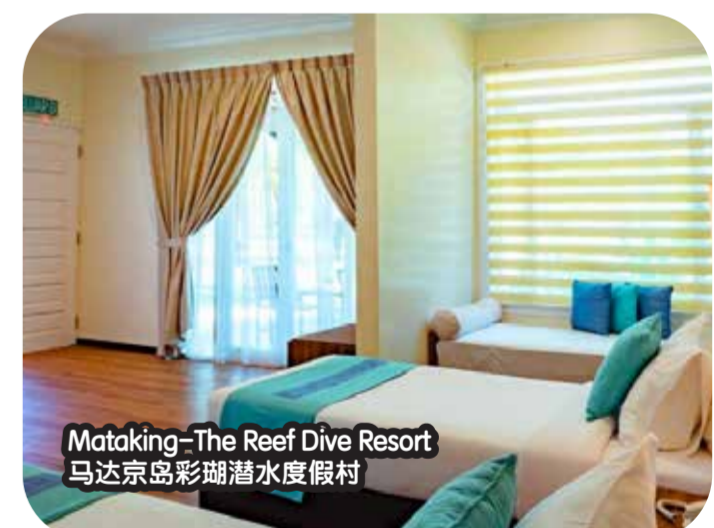
Matakings-The Reef Dive Resort 马达京岛彩湖潜水度假村