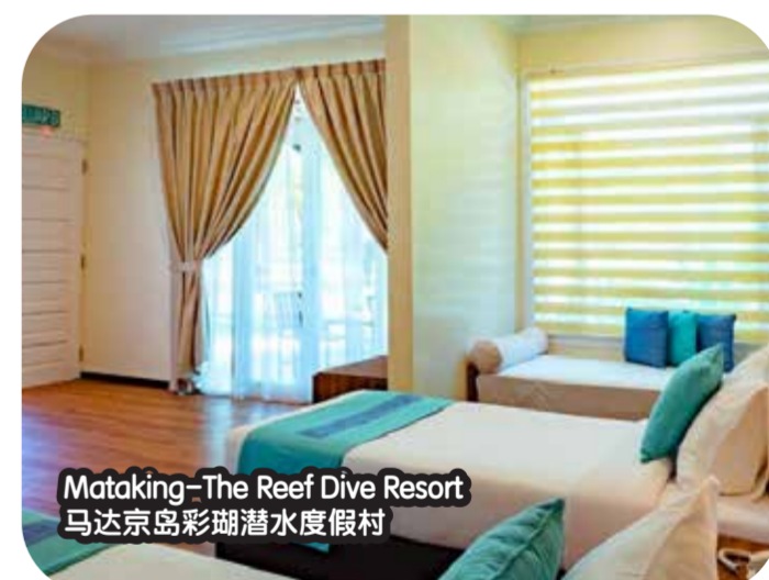
Mataking-The Reef Dive Resort 马达京岛彩瑚潜水度假村