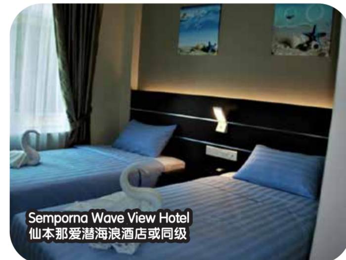
Semporna Wave View Hotel 仙本那爱潜海浪酒店或同级