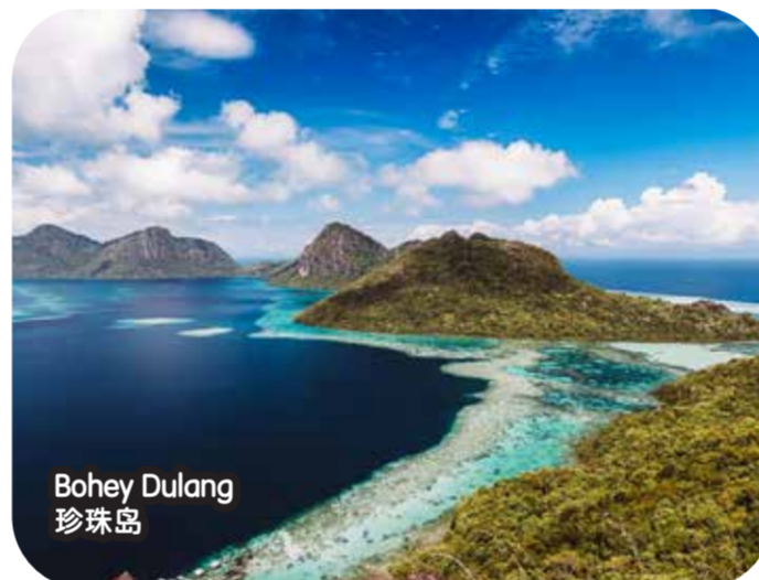
Bohey Dulang 珍珠岛