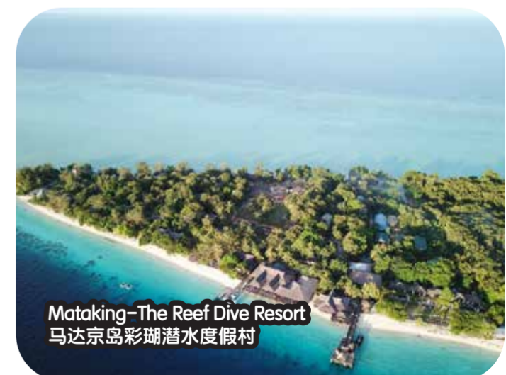
Matakings-The Reef Dive Resort 马达京岛彩湖潜水度假村