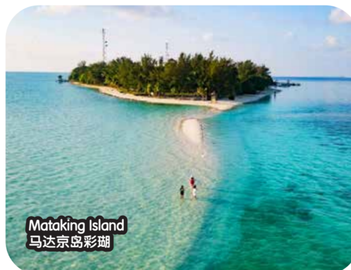
Matakings Island 马达京岛彩湖