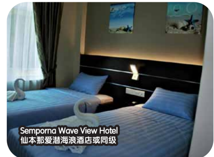
Semporna Wave View Hotel 仙本那爱潜海浪酒店或同级