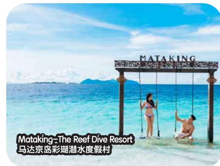
Mataking-The Reef Dive Resort 马达京岛彩瑚潜水度假村