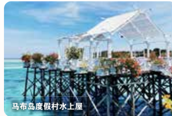
马布岛度假村水上屋