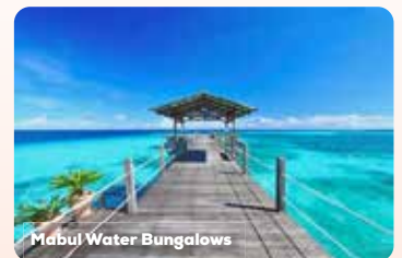
Mabul Water Bungalows