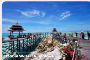
Mabul Water Bungalows