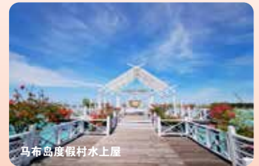
马布岛度假村水上屋