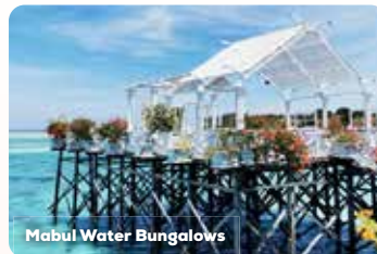
Mabul Water Bungalows