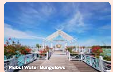
Mabul Water Bungalows