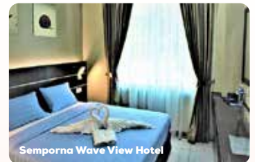
Semporna Wave View Hotel