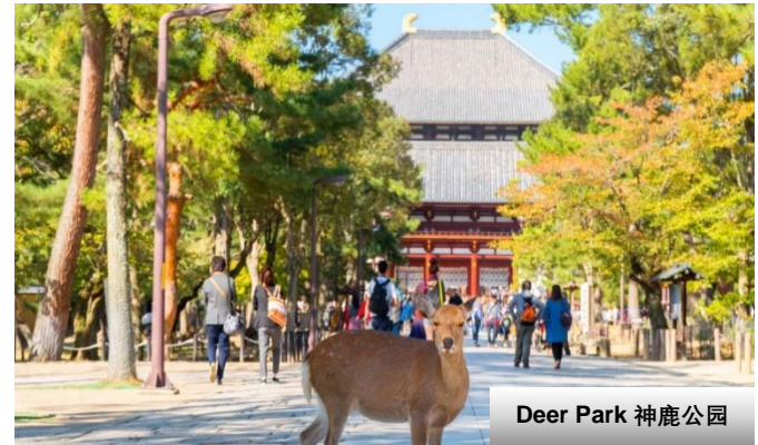
Deer Park 神鹿公园

*Sequence of itinerary subject to arrangement*