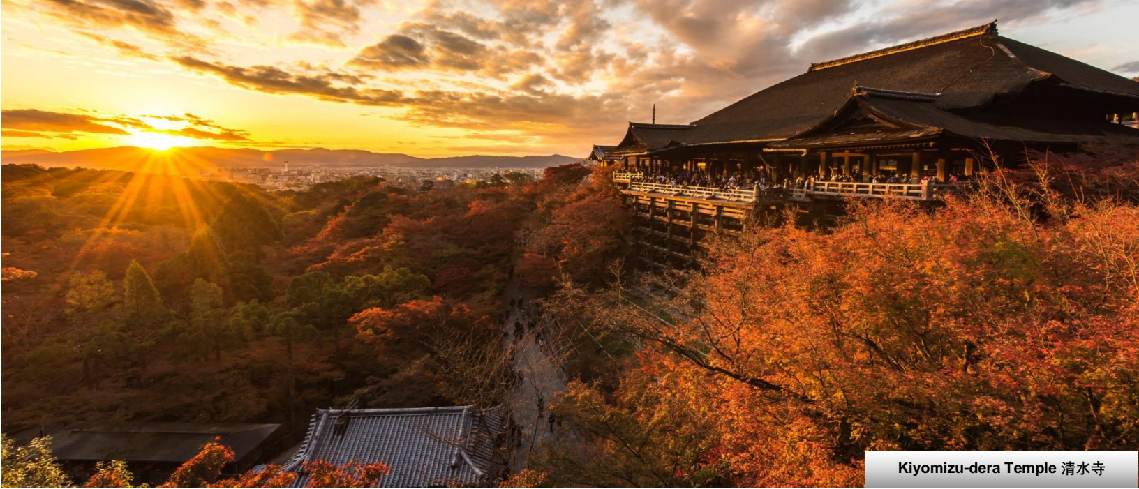
Kiyomizu-dera Temple 清水寺