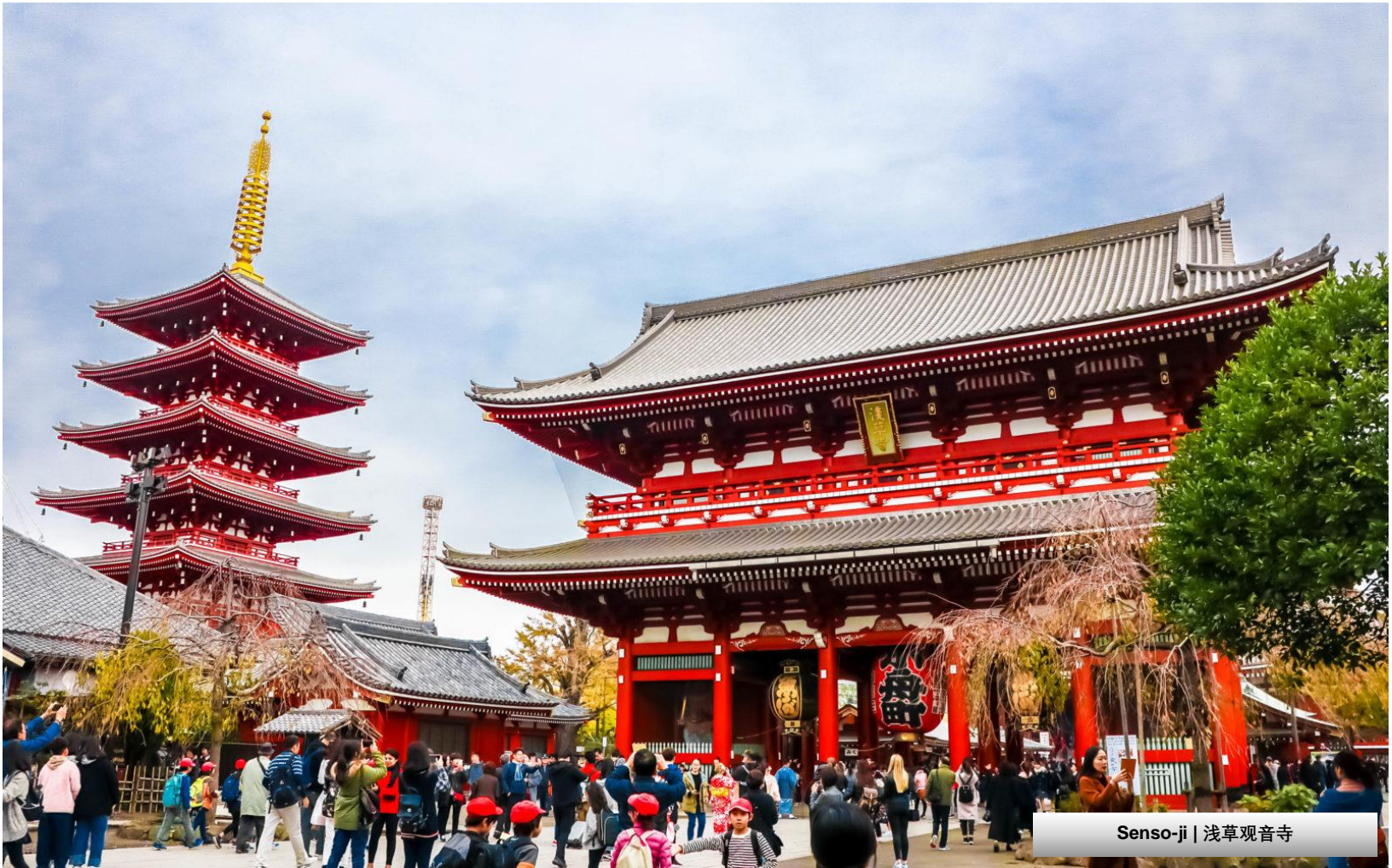
Senso-ji | 浅草观音寺