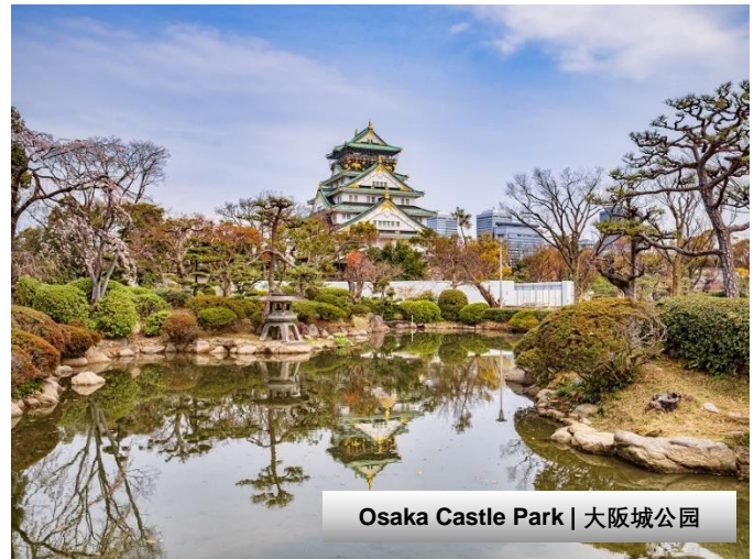
Osaka Castle Park | 大阪城公園