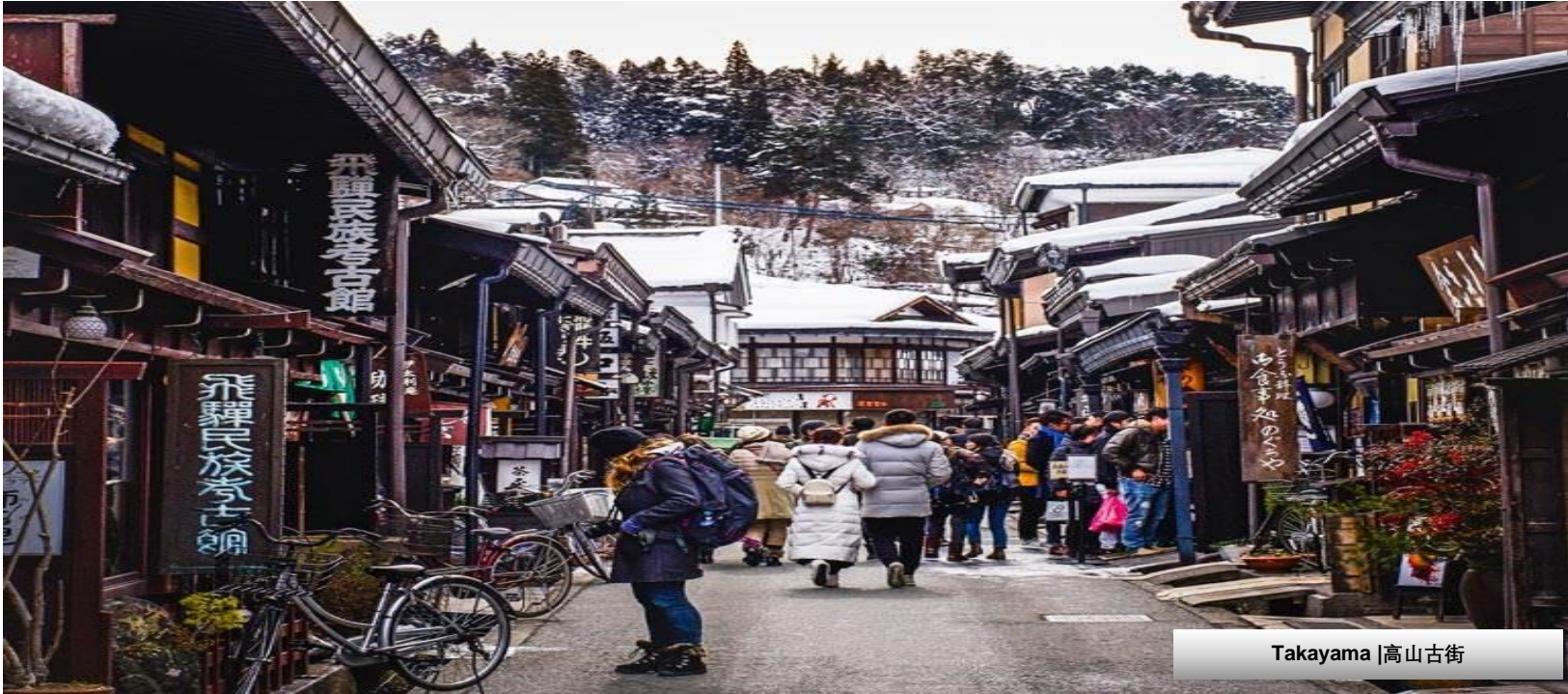
Takayama | 高山古街