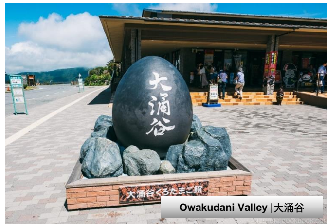
Owakudani Valley |大涌谷

早餐后,自行乘搭酒店穿梭巴士前往日本成田机场搭机返回温暖的家, 结束愉快的旅程。