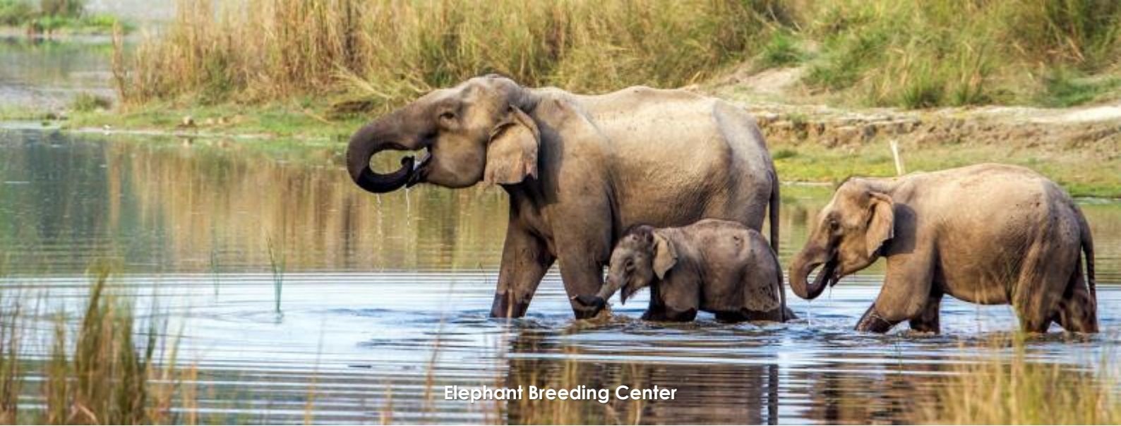
Elephant Breeding Center