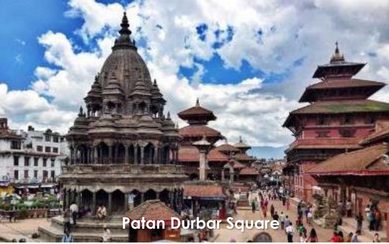
Patan Durbar Square