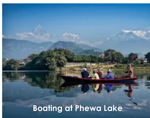
Boating at Phewa Lake