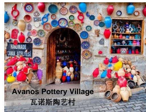
Avanos Pottery Village 瓦诺斯陶艺村

<Hot air ballooning over the charming landscape during sun rise time