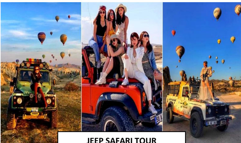
JEEP SAFARI TOUR