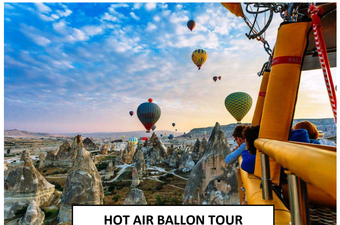
HOT AIR BALLON TOUR