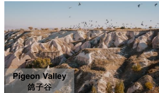
Pigeon Valley 鸽子谷