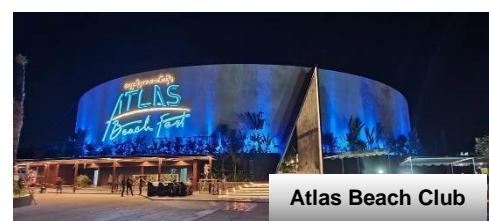
Atlas Beach Club

*Sequence of itinerary subject to arrangement*