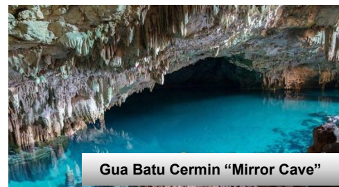
Gua Batu Cermin “Mirror Cave”