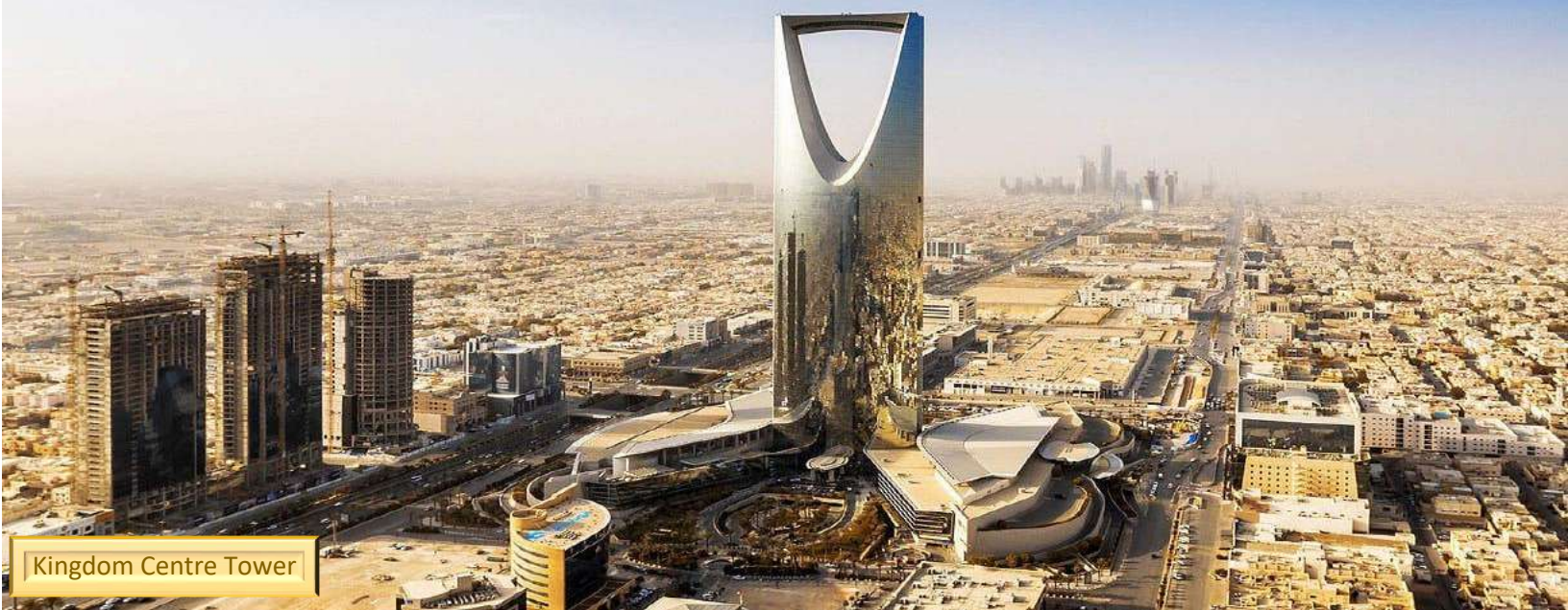
Kingdom Centre Tower