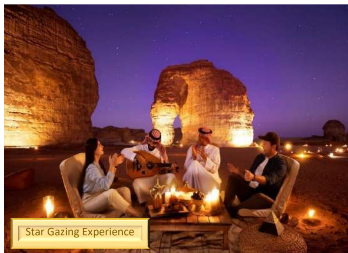
Star Gazing Experience

Accommodation: SHAZA HOTEL 4* or similar 沙扎酒店或相似酒店