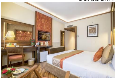
香格里拉酒店或同级 Shangri-La Kathmandu or similar http://www.hotelshangrila.com/kathmandu 569, 兰兹帕特, 加德满都