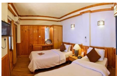
乡村别墅酒店或同级 Hotel Country Villa or similar http://www.hotelcountryvilla.com/ 纳加阔特, 尼泊尔 Naldum Road, 44812, Nepal