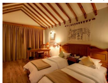
喜马拉雅俱乐部或同级 Club Himalaya Resort or similar http://www.clubhimalaya.com/ 纳加库特, 那加阔 Windy Hills. Naaarkot. Bhaktapur. Nepal