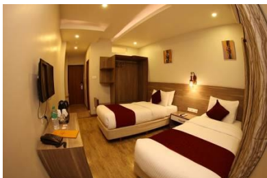
加德满都艺术酒店或同级 Hotel Arts or similar 泰美尔, 44600 加德满都 Chaksibari Marg, Thamel

*Image Shown are for illustration purposes only*