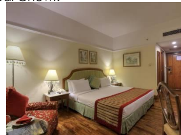
丽筠酒店或同级 Hotel Radisson or similar https://www.radisson.com/kathmandu-hotel-np/nepkathm 兰兹帕特, 加德满都 Lazimpat, PO Box 2269 Kathmandu