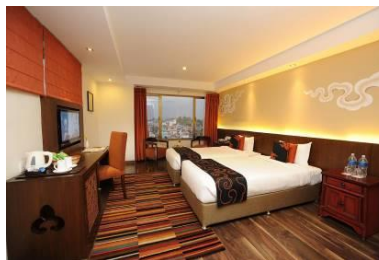
香巴拉酒店或同级 Hotel Shambala or similar http://www.shambalahotel.com/ 马哈拉杰贡伊, 加德满都 Bansbari, Narayan Gopal Chowk