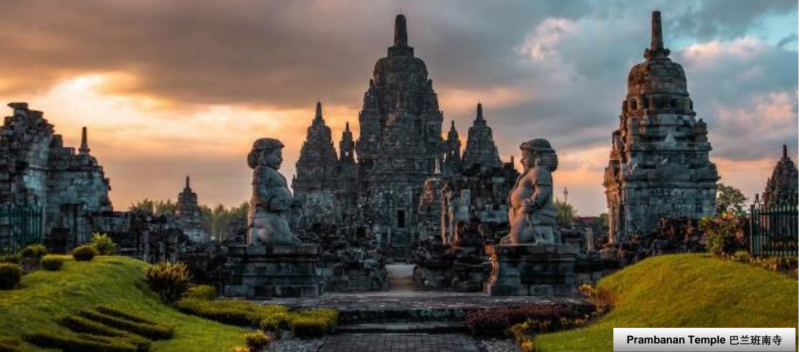
Prambanan Temple 巴兰班南寺