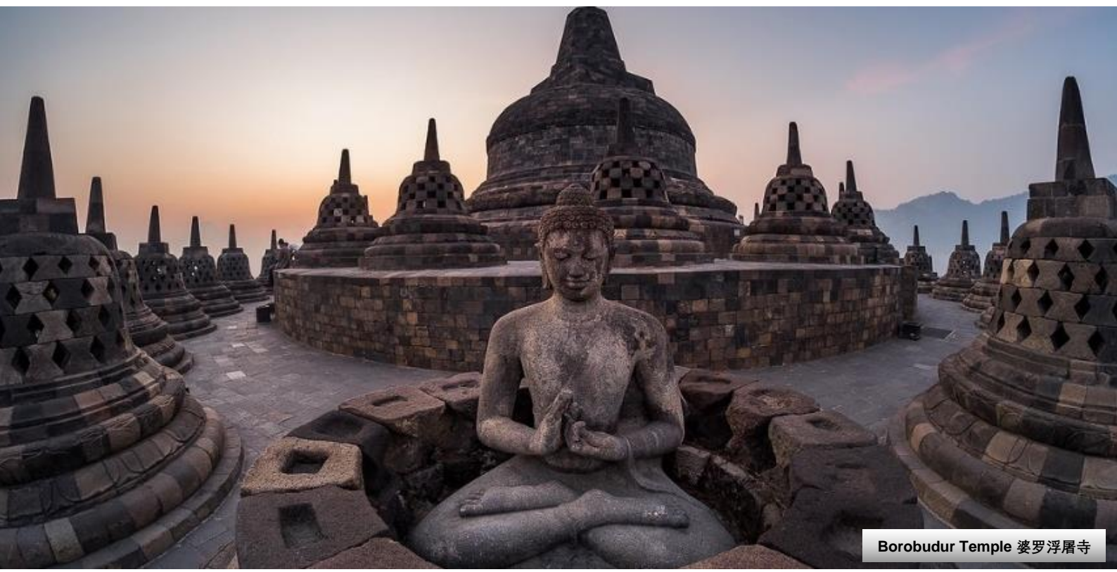
Borobudur Temple 婆罗浮屠寺

Borobudur is a 9th-century Mahayana Buddhist temple in Magelang Regency in Central Java, Indonesia. It is the world’s largest Buddhist temple. The temple consists of nine stacked platforms, six square and three circular, topped by a central dome. It is decorated with 2,672 relief panels and originally 504 Buddha statues. The central dome is surrounded by 72 Buddha statues, each seated inside a perforated stupa. Borobudur lay hidden for centuries under layers of volcanic ash and jungle vegetation.