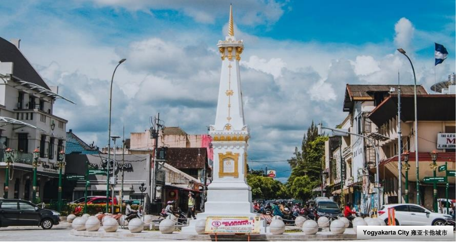
Yogyakarta City 雍亚卡他城市

Yogyakarta (often called “Jogja”) is a city on the Indonesian island of Java. Its ornate 18th-century royal complex, or kraton, encompasses the still-inhabited Sultan’s Palace. Also, within the kraton are numerous open-air pavilions that host classical Javanese dance shows and concerts of gamelan music, characterized by gongs, chimes and plucked string instruments.