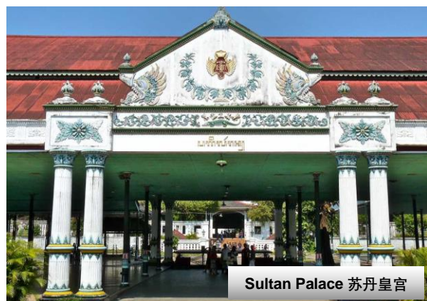
Sultan Palace 苏丹皇宫

Breakfast at hotel, transfer to airport for flight home.