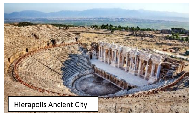
Hierapolis Ancient City