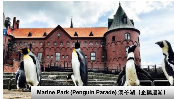
Marine Park (Penguin Parade) 洞爷湖 (企鹅巡游)