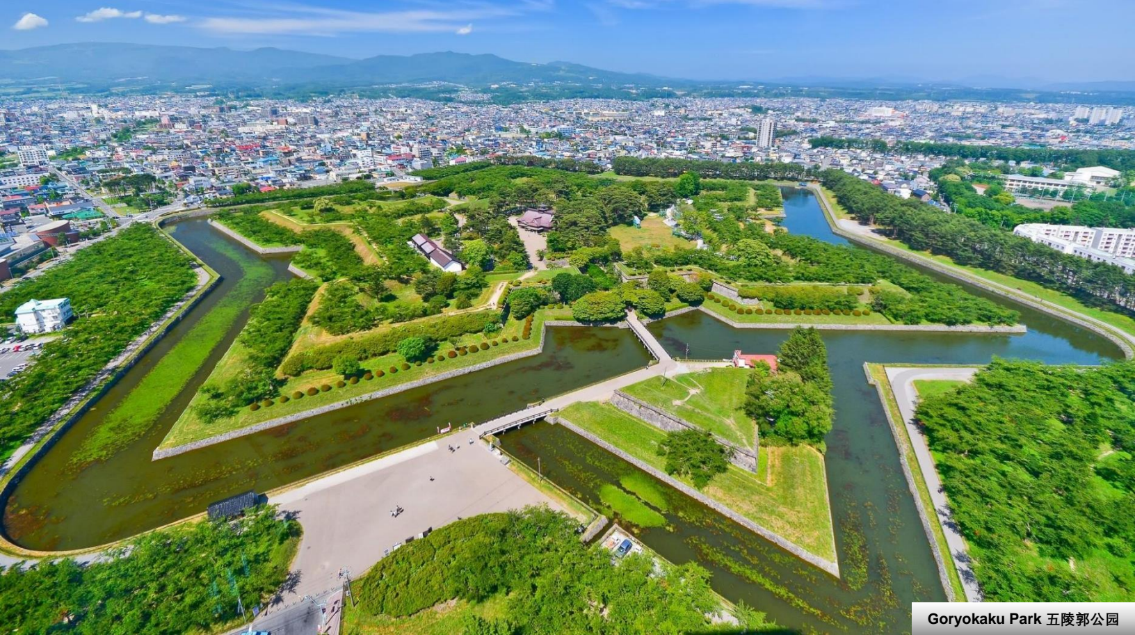
Goryokaku Park 五陵郭公园