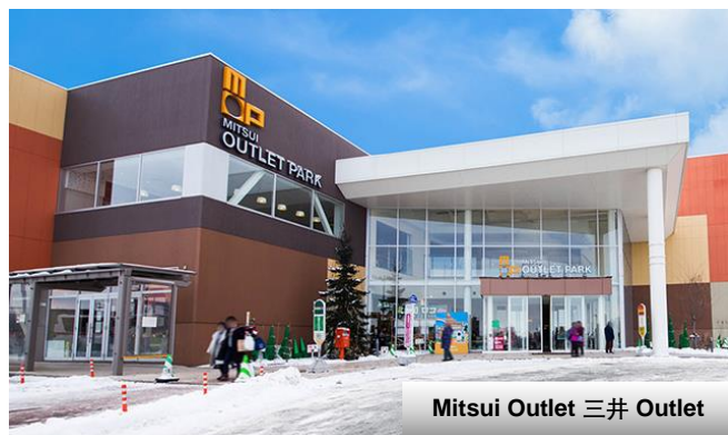
Mitsui Outlet 三井 Outlet