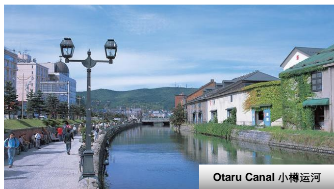
Otaru Canal 小樽运河