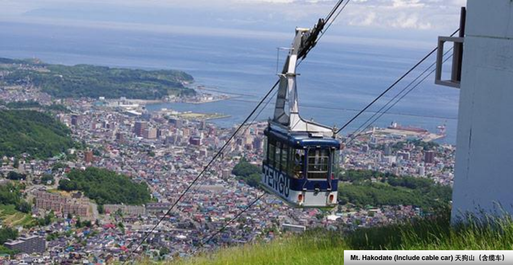
Mt. Hakodate (Include cable car) 天狗山 (含缆车)